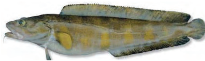
Cusk, Brosme brosme .