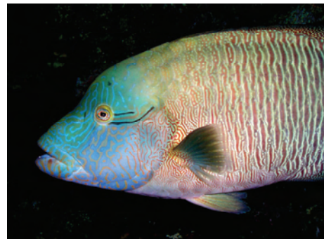
Humthead wrasse, Cheilinus undulatus .

a new format with more information on status, research needs, and references and range maps for all species.