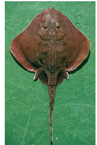
Thorny skate, Amblyraja radiata .

Internal funding of $180,000 was competitively awarded to 7 projects from NMFS Science Centers and Regions. Unlike past years, the competition was open to proposals for work on listed species. Ten proposals were submitted, but all funded projects were for work on Species of Concern.