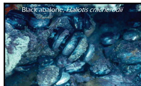
Black abalone, Haliotis cracherodii