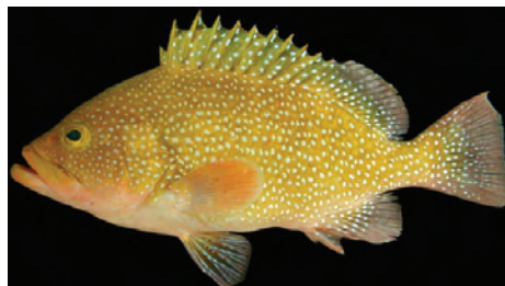
Speckled hind, Epinephelus drummondhayi .

tion program and to help fund some ongoing SOC grant projects in FY08.