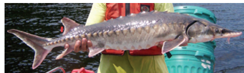
Atlantic sturgeon, Acipenser oxyrinchus .

Atlantic Sturgeon Status Review Team. 2007. Status Review of Atlantic sturgeon. 174 pp. http://www.nero.noaa.gov/prot_res/CandidateSpeciesProgram/AtlSturgeonStatusReviewReport.pdf .