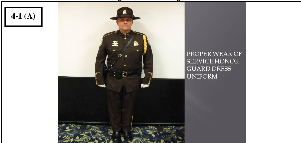
Figures 4-1A through D

*See Figures 4-1A through D below for a description and demonstration of the proper way to wear the SHG uniform.