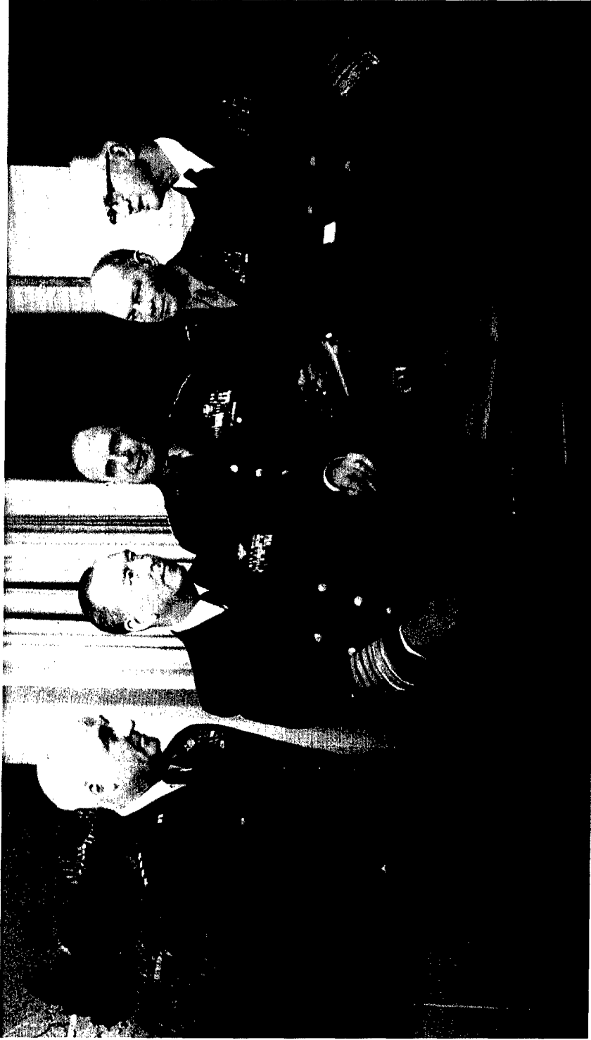
The Joint Chiefs of Staff, 22 January 1954. Left to right: General Nathan F. Twining, Chief of Staff, USAF; Admiral Arthur W. Radford, USN, Chairman, JCS; General Matthew B. Ridgway, Chief of Staff, USA; General Lemuel C. Shepherd, Jr., Commandant, USMC; and Admiral Robert B. Carney, Chief of Naval Operations, USN.