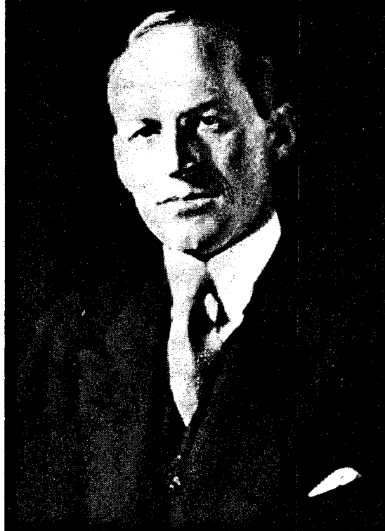
Millard E. Tydings, Senator from Maryland, 1927-51.

Do Senators think that the people of this country have lost their common sense, that each and every poor man does not know that he has to work to raise the money with which to pay this huge debt? I know there is "pork" in the bill. There is some Maryland "pork," and the project in Maryland is a good one, and I should like to see it go into the bill, and I should like to see the work done. But, gentlemen, we have not the money with which to indulge in this