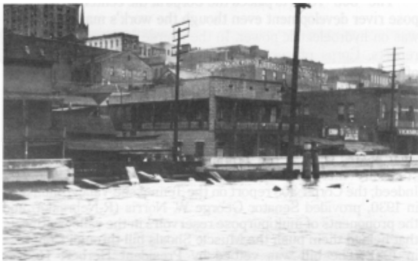
Vicksburg, Mississippi, during the 1927 flood.

aftermath of the “greatest disaster of peace times in our history,” in the words of Herbert Hoover, then Secretary of Commerce? Hoover was describing the 1927 Mississippi River flood, which at its height covered 26,000 square miles in seven states. More than 700,000 people were driven from their homes. In some areas the collapse of newly constructed higher levees meant that the floodwaters, which had in the past risen slowly, now rushed across the level countryside and 330,000 people had to be rescued from housetops, levee crowns, and trees. Due to massive and heroic rescue efforts, only about 250 people drowned before boats could get to them.