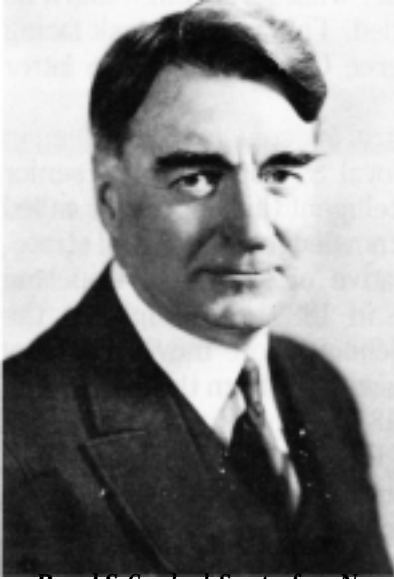
Royal S. Copeland, Senator from New York, 1923-1938.

the private power companies -many of whose stockholders lived in New York. Again, in the early stages of the Commerce Committee hearings in 1936, Copeland told the New York Times that he hoped to exclude all reservoirs that combined hydroelectric production with flood control from the flood control bill. He feared that these multipurpose reservoirs would not only drive the total cost of the program too high, but he "mistrusted putting the Federal Government any further into the business of generating and selling elec-