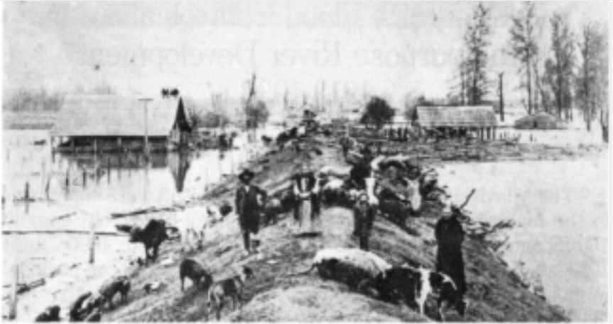
Refugees and livestock on a levee during the Mississippi River flood, 1912.

Newlands, and a brilliant group of conservationists who worked closely with him, convinced President Theodore Roosevelt that traditional rivers and harbors navigation projects should not be considered separately from other possible water resources uses. In 1907, the year of the great Pittsburgh flood, Roosevelt appointed an Inland Waterways Commission to study the entire question of water resources. The commission, guided by Newlands and his associates, recommended that the federal government undertake a coordinated program of multipurpose river development under the control of a permanent commission appointed by the President. 4