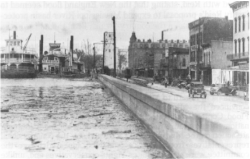
Floodwall at Cairo, Illinois, during the 1927 flood.

attempted to defend the “levees only” policy. Everyone from the poorest sharecropper to the richest landowner understood that something more than levees was necessary, although exactly what was much debated in the coming years. Major General Edgar Jadwin, the Chief of Engineers, further alienated public opinion when, in what seemed an arrogant and obstreperous manner, he defended his recommendations for a new Mississippi River flood control project against all critics, including some of the most well-respected engineers in the country. In particular, he attacked the rival plan of the Mississippi River Commission, from which he had in fact borrowed some of his ideas—both plans called for a mixture of spillways, floodways, levees, and channel clearing—but Jadwin’s plan substantially decreased the amount of federal dollars to be committed to the project.