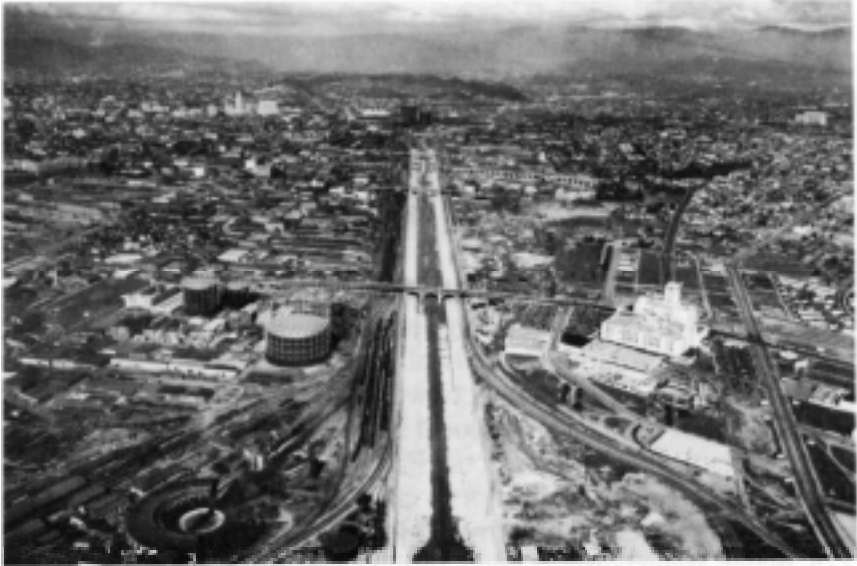
One result of the 1936 Flood Control Act: a concrete flood control channel to help prevent the Los Angeles River from flooding metropolitan Los Angeles. The city hall is in the background at the left. This picture was taken in 1941.

Charles E. Merriam were men of vision and intelligence who should have accepted the fact that pork barrel legislation was a factor in the American democratic political process — especially in a presidential election year. President Roosevelt's public statements about using the NRC to scrutinize the pork barrel projects on rivers, harbors, and (after 1936) flood control legislation only stiffened congressional resistance to the agency. By the end of the 1930s, even the Republicans had abandoned the NRC, seeing it more as an example of presidential authority than as a deterrent to irresponsible spending. Its elimination by Congress in 1943 was part of a general reaction against the whole concept of centralized federal planning in which the rivers-harbors-flood control bloc was only one factor. 1