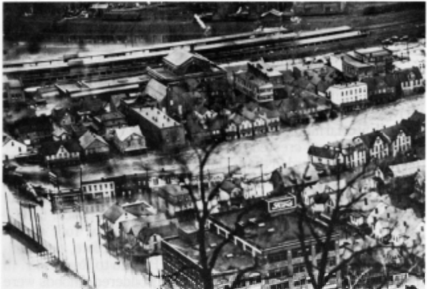
Johnstown, Pennsylvania, during the 1936 flood.