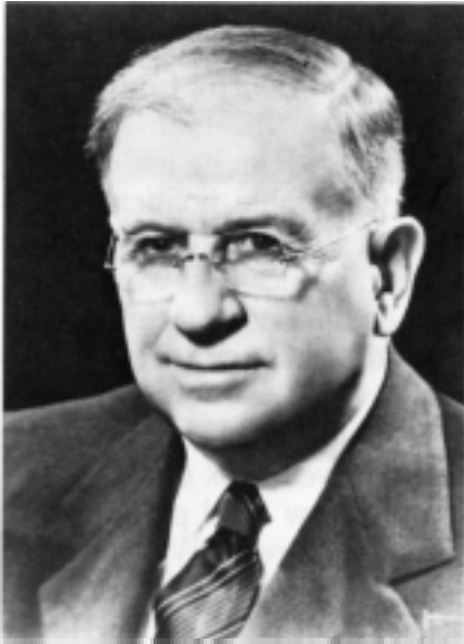
Harold L. Ickes, Secretary of the Interior, 1933-1946.

on the lower Mississippi, who received flood protection. The theme of multipurpose development was refined by Norris during his long fight in the 1920s to develop the Tennessee Valley. 17 In 1932 Norris left the Republican party to campaign for Roosevelt. The two became good friends and political allies throughout the New Deal, and Norris often served as an administration spokesman in Congress. In January 1933, a short time before his inauguration, Roosevelt announced his support for Norris's Tennessee Valley program. The TVA bill was