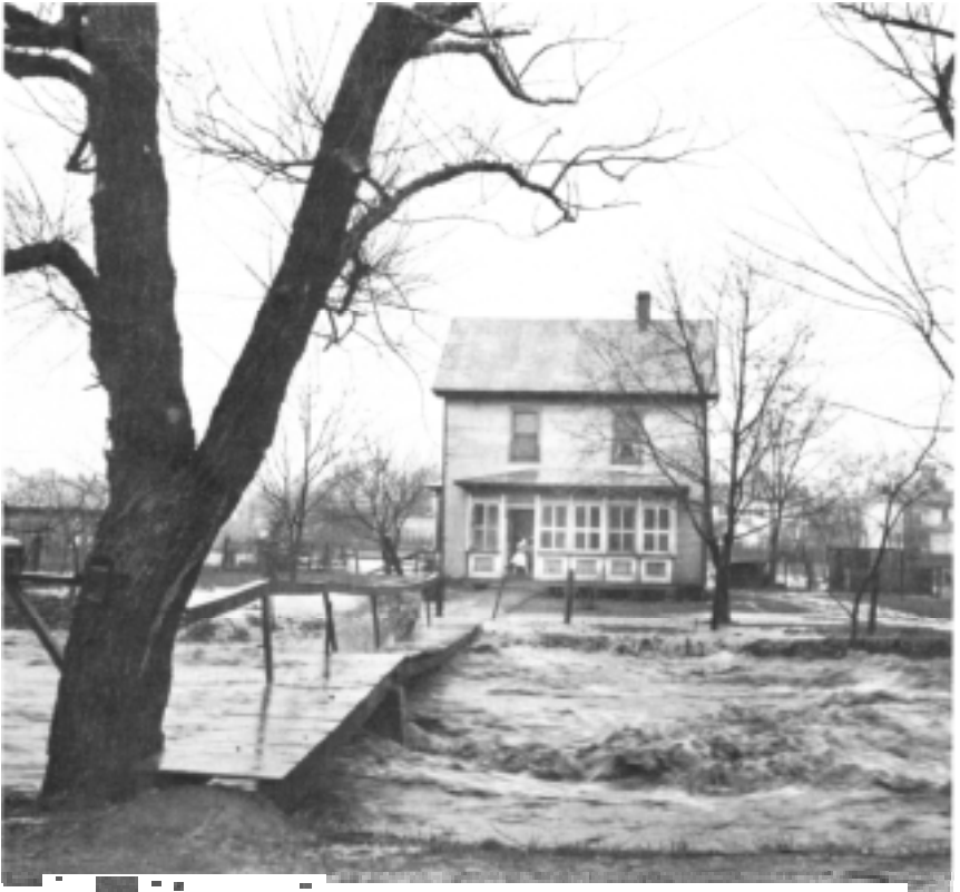
Swollen mountain stream threatening a valley home in West Virginia, March 1936.