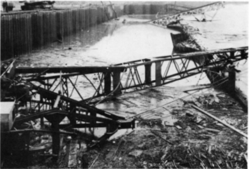
Flooded cofferdam at Emsworth Lock, Ohio River below Pittsburgh, 24 March 1936.