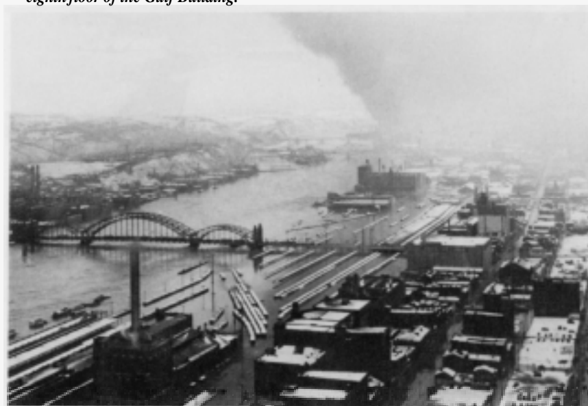
Allegheny River at Pittsburgh, Pennsylvania, 18 March 1936, viewed from the thirty-eighth floor of the Gulf Building.