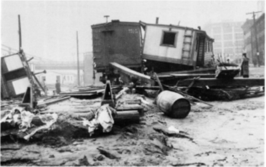
Allegheny River flood wreckage, Pittsburgh, Pennsylvania, 20 March 1936.