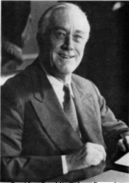
President Franklin Delano Roosevelt.

some form of nationwide flood control administered by an agency of the federal government, and that it should be financed in some measure by federal funds. This left five specific areas of disagreement: the degree to which the flood control effort should be linked to a larger multipurpose river basin development program; the agency that should administer the program; the proper division of costs between the federal government and the state and local interests; the advisability of combining watershed soil conservation pro-