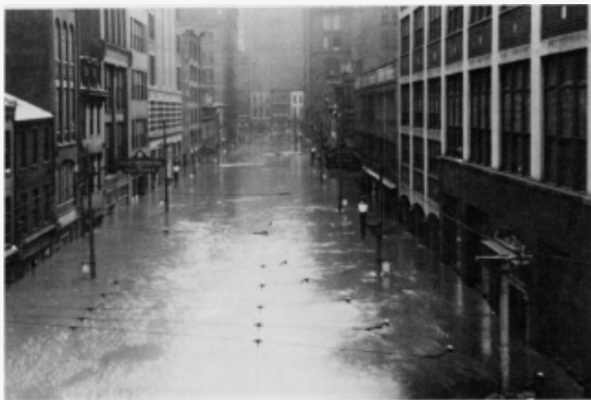
Duquesne Way and 9th Street, Pittsburgh, Pennsylvania, 18 March 1936.