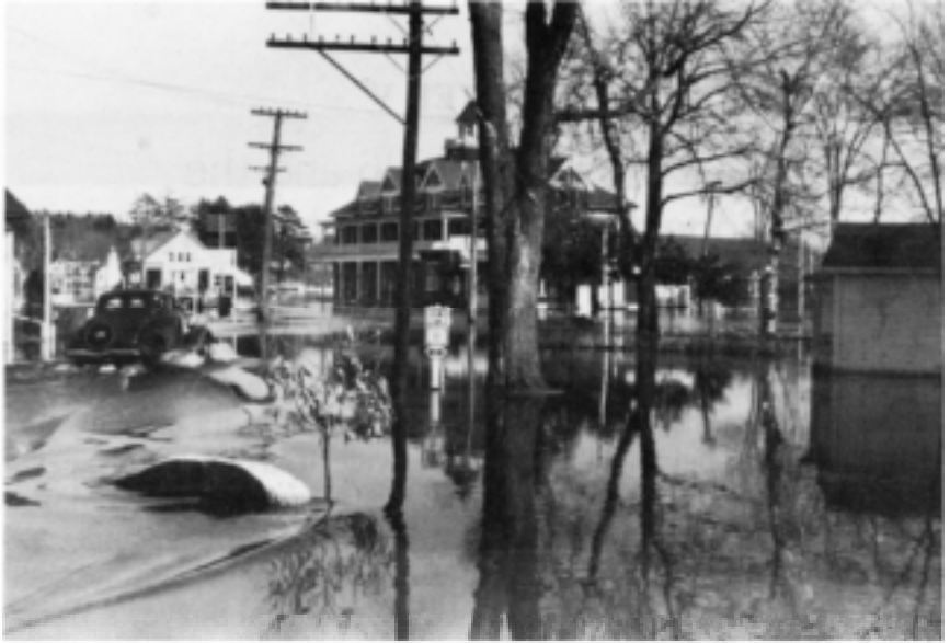
Sebago Lake flooding highway in southwestern Maine, March 1936. Photo by Paul Carter