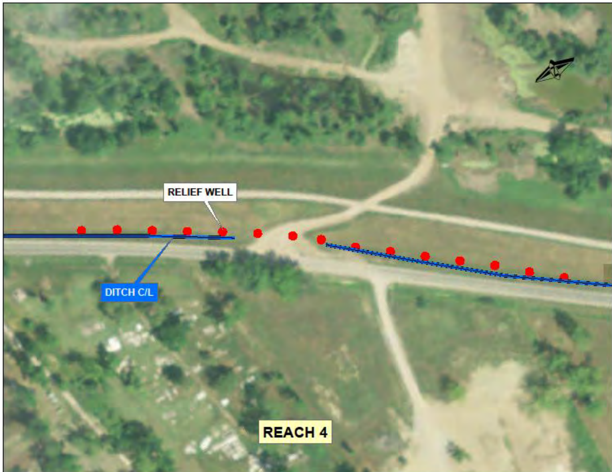
Figure 3: Reach 4