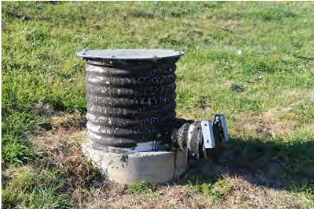
Figure 5: Typical Relief Well

The typical relief well has a diameter of 8 inches and stands approximately 20 inches above ground. A concrete pad may or may not be present to direct flow from the well.