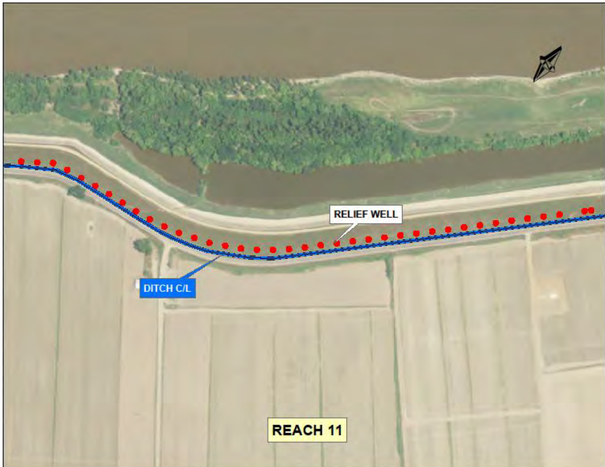
Figure 4: Reach 11