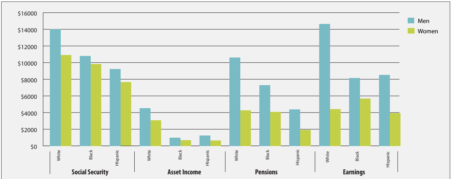
Figure 3. Access to Retirement Income for Women and Men Ages 65 Years and Older, for Largest Race and Ethnic Groups, 2011

Note: Average annual income for each source includes zero values. The population groups “Asian Americans and Hawaiian/Pacific Islanders” and “Other” are excluded from the analysis because of small sample sizes. The circle indicates the amount of retirement income for men, the top of the rectangle retirement income for women.