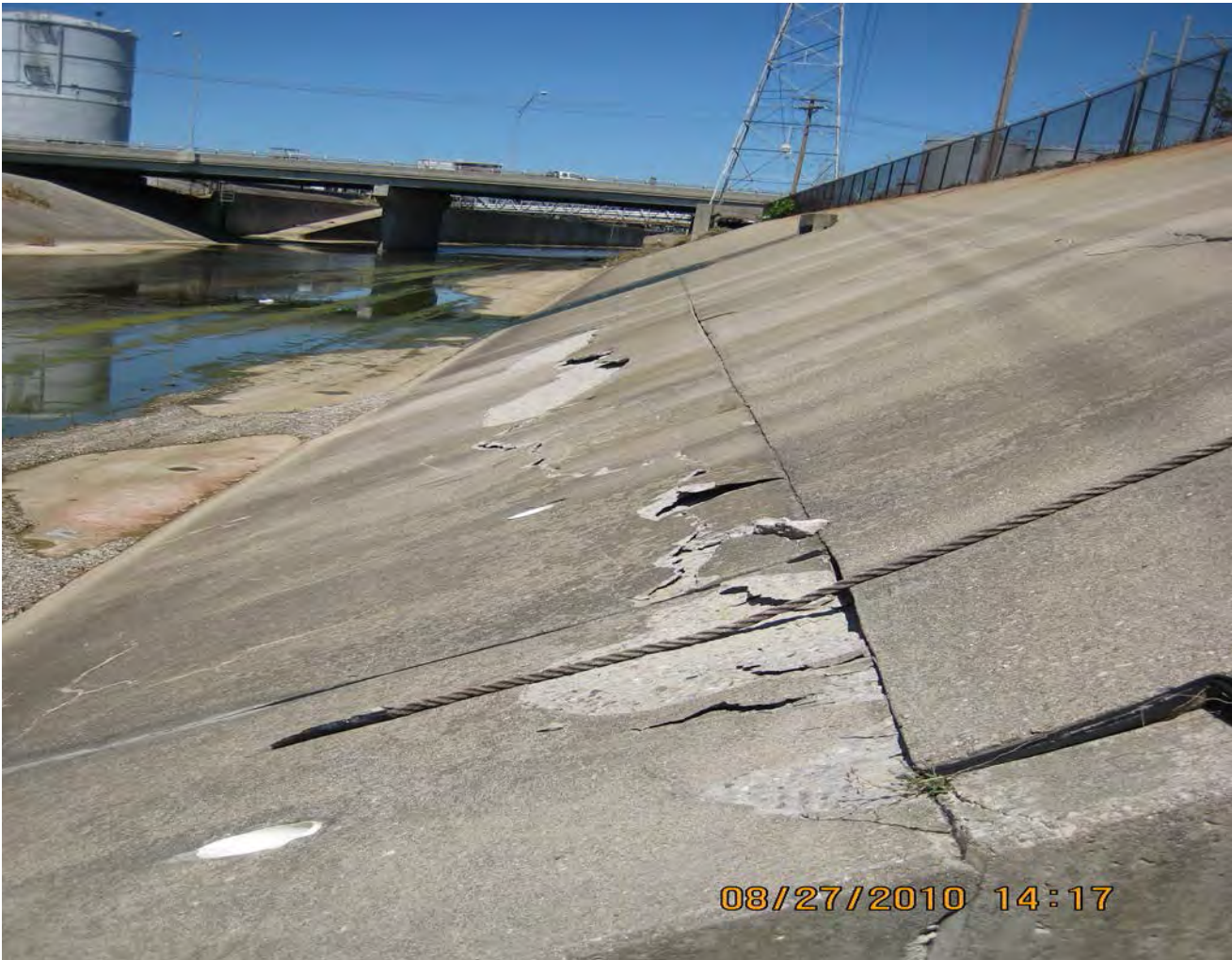
Wall Failure in Section 4A due to failure of a corrugated metal pipe

Construction on the Section 3 Punch List/ Maintenance Work Contract was awarded in February 2003 and completed in May 2004. Section 3 was turned over to the Non-Federal Sponsor for Operation and Maintenance in October 2004. The Flood Warning System (FWS) was approved in December 2003 at 100% federal funding. The installation of the FWS was completed in September 2004.