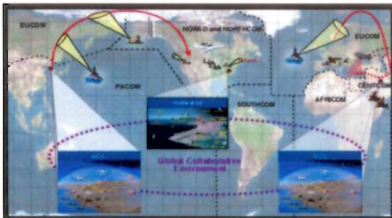
IAMD Operational Concept (OV-1)

The vision for 2020 Joint Integrated Air and Missile Defense (IAMD) is one where all capabilities—defensive, passive, offensive, kinetic, non-kinetic (e.g., cyber warfare, directed energy, and electronic attack)—are melded into a comprehensive Joint and combined force capable of preventing an adversary from effectively employing any of its offensive air and missile weapons. IAMD systems are expensive by nature—we simply will not be able to afford everything we need. As a result, the approach for IAMD in 2020 will be balanced, taking into account a full range of opportunities including diplomacy, a robust approach to passive defense both left and right of enemy launch, electronic warfare, active defense, and increased cooperation with our friends and allies.