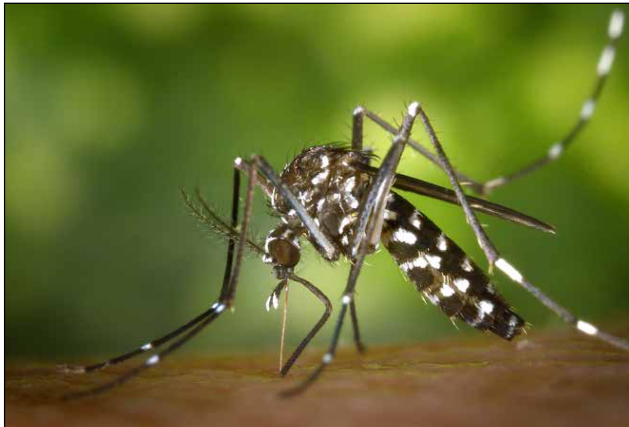
Asian Tiger mosquito transmits the Zika virus.

“This tiered approach permits us to attack the mosquito population throughout all stages of the insect’s life cycle: egg, larvae, pupae and adult,” Rodriguez-Cruz said. “This approach implements Integrated Pest Management practices that rely on the judicious use of both chemical and non-chemical treatments to prevent and control mosquitoes. This methodology minimizes potential environmental impacts and prevents pollution by reducing sole reliance on pesticides. Also, surveillance of mosquito populations helps determine the need for control and helps us to monitor the effectiveness of the program.”