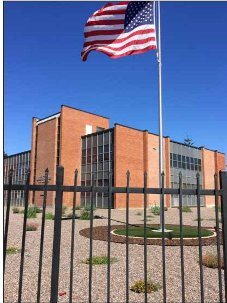
A xeriscape project at the U.S. Army Reserve Center in West Los Angeles, California, replaced grass and reduced watering costs/usage and landscaping costs (mowing).

EO 13423 was signed by President Bush in 2007 to Strengthen the Federal Environmental Energy and Transportation Management. The goals were to increase energy efficiency by making it mandatory to reduce energy intensity by 30 percent from fiscal year 2003 to 2015, reduce greenhouse gas emissions, use energy from renewable sources, construct sustainable buildings and conserve water