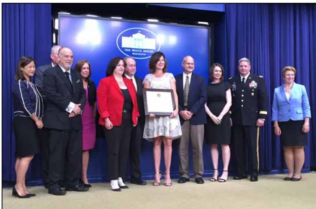
Receiving the Green Innovation GreenGov Award on Sept. 7 were employees from the U.S. Army Corps of Engineers Fort Worth District, U.S. Army Engineer Research and Development Center Construction Engineer Research Laboratory and Headquarters Corps of Engineers along with senior leadership from the Department of Defense, Army and U.S. Army Corps of Engineers. The award was presented for the work the joint team did in combining two tools, the Net Zero Planner and the Comprehensive Asset Master Planning Solution Dashboard, into one tool that identifies sustainability and energy implications in military installation planning and automates identification of energy efficiency measures.

The White House Council on Environmental Quality presented 12 GreenGov awards during a Sept. 7 ceremony at the Eisenhower Executive Office Building to federal agency teams and individuals who fulfill President Obama's mandate to "lead by example" in implementing Executive Order 13693: Planning for Federal Sustainability in the Next Decade.