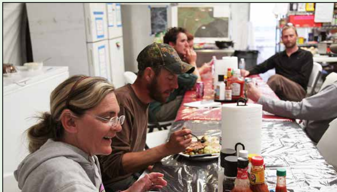
Workers sit down for a meal of prime rib and mashed potatoes June 22 at Attu Island, Alaska. The island, at the tip of the Aleutian chain, became home to more than 20 workers — some for more than a month — this summer during an environmental cleanup project for the U.S. Army Corps of Engineers, Alaska District's Formerly Used Defense Sites program.