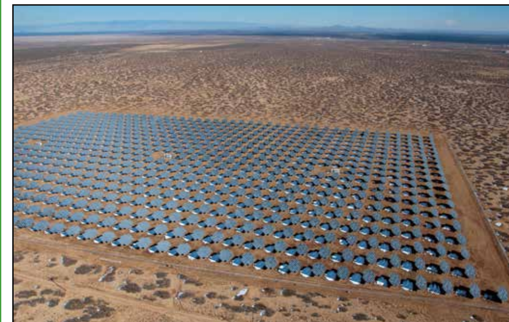
Aerial view of the solar photovoltaic array at White Sands Missile Range, New Mexico. The panels cover 42 acres and provide more than 4 megawatts of electricity to the base.