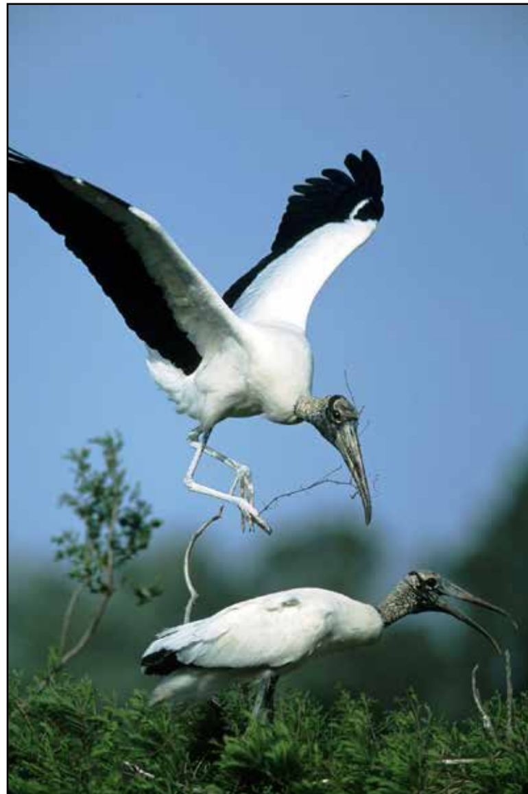
An endangered wood stork comes in for a landing at Pinckney Island National Wildlife Refuge in South Carolina.

Click! The shutter released just in time.