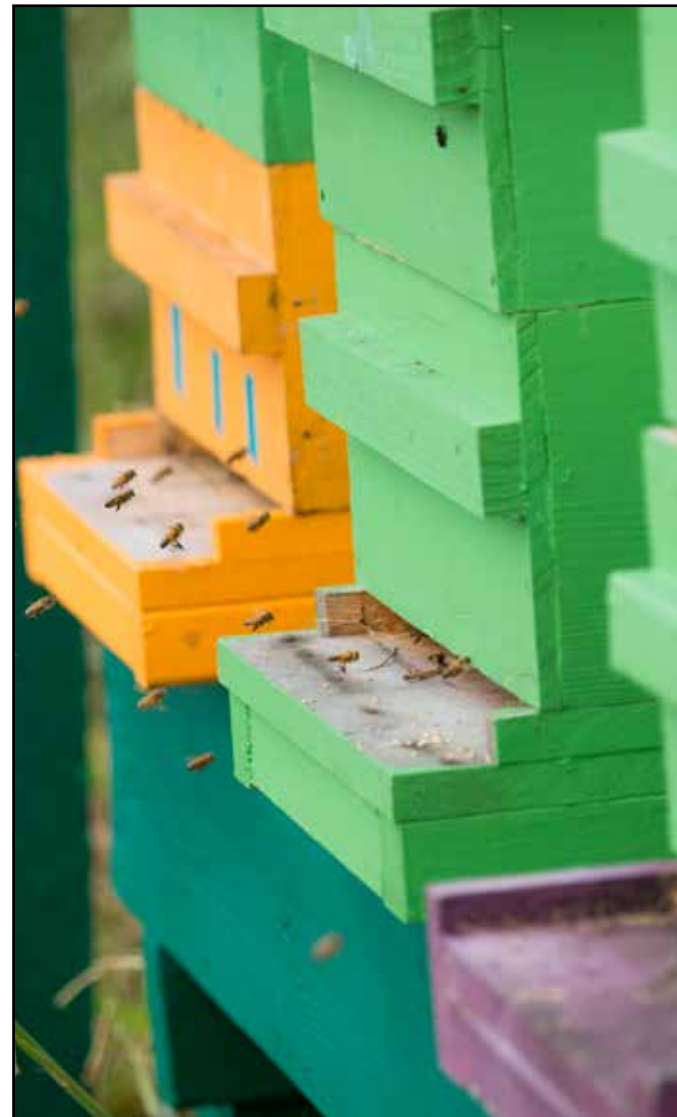
Five brightly colored hives are set up on the St. Stephen Powerhouse property. Each hive has approximately 20,000 bees but will eventually grow to 50,000.

To get this new pollination program up and running, the Charleston District is partnering with Charleston Community Bee Gardens, which is providing the hives and a beekeeper to