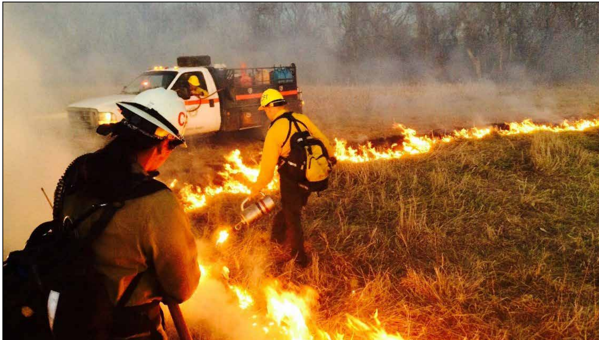
Controlled burns, conducted at U.S. Army Reserve training areas for the 88th Regional Support Command, are used for invasive species control and help to maintain healthy and diverse ecosystems.

"We enjoy the diversity of the work," said Carla Heck, USACE Louisville District project manager. "Although some of these projects are smaller, seeing them through to completion makes it nice, and we feel good knowing we're helping the 88th maintain and maximize the size of its facilities." ☺