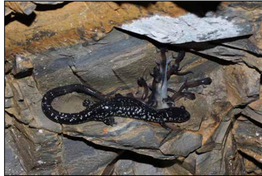
Salamander ( Plethodon albagula ) and a clutch of newly hatched young!

Amphibian populations have dropped significantly within the past 20 years. These declines reflect greater environmental issues and changes. Healthy populations of salamanders in a given area can be an indicator of the overall environmental health of that area. The more direct connection to people is the amazing ability salamanders have to regrow entire limbs and regenerate parts of major organs. Studies are now underway to understand these abilities and to replicate