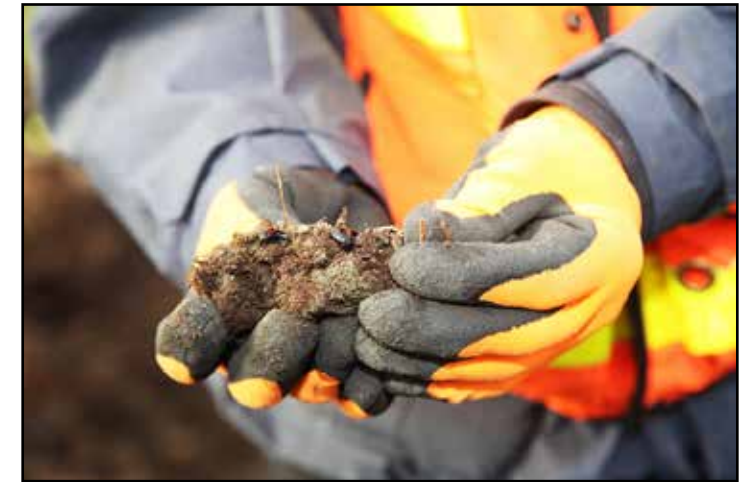
A piece of contaminated soil June 20 at Attu Island, Alaska. During an environmental cleanup project on the island, the Corps oversaw the removal of about 10,000 tons of petroleum, oil and lubricant-contaminated soil; 5 tons of lead-contaminated soil; 70 tons of tar drums; and 52 above-ground storage tanks.

"Bristol has great experience at providing all the requirements necessary to operate in remote Alaska for months at a time, and they demonstrated it once again," Sorum said.