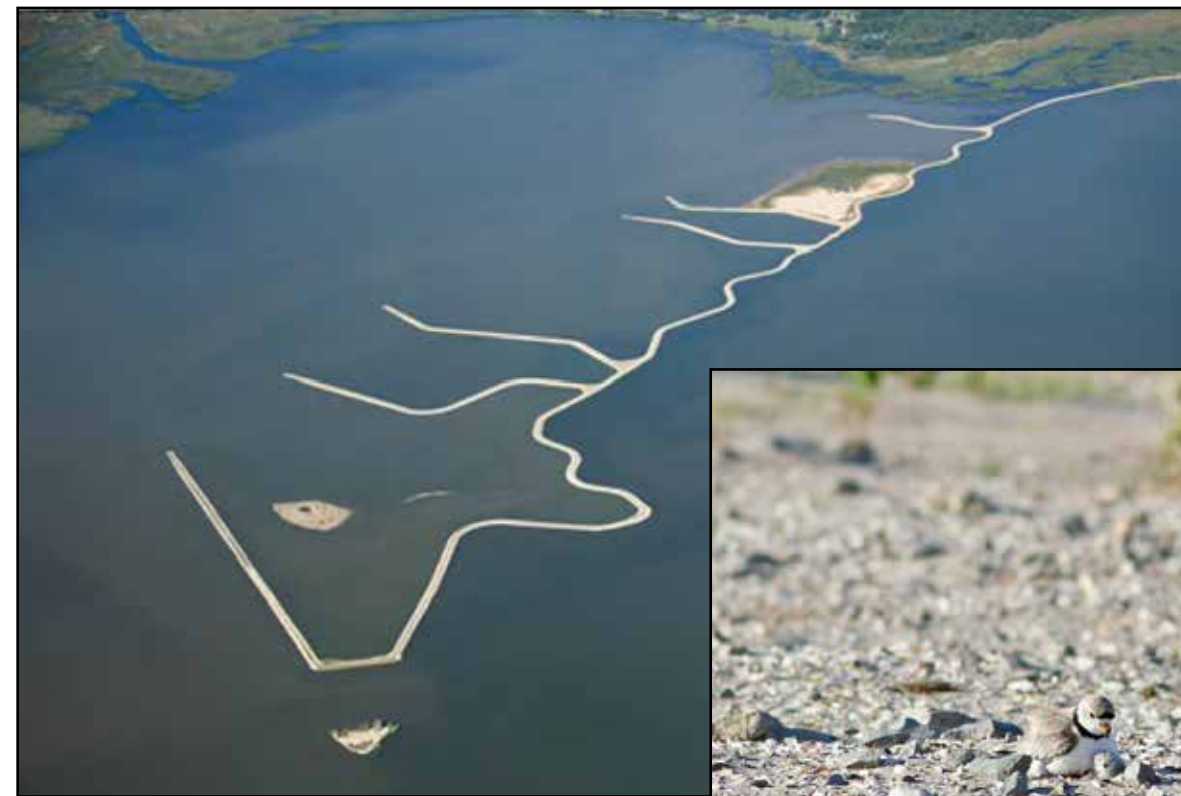
Left: Aerial photo of Cat Island after first year of clean dredge material was placed on the West Island.

Dissipated in the 1960s, Cat Island consisted of three islands located west of the mouth of the Fox River in Green Bay. Cat Island reconstruction will restore and protect 274 acres of terrestrial habitat and 1,400 acres of wetland. ☺