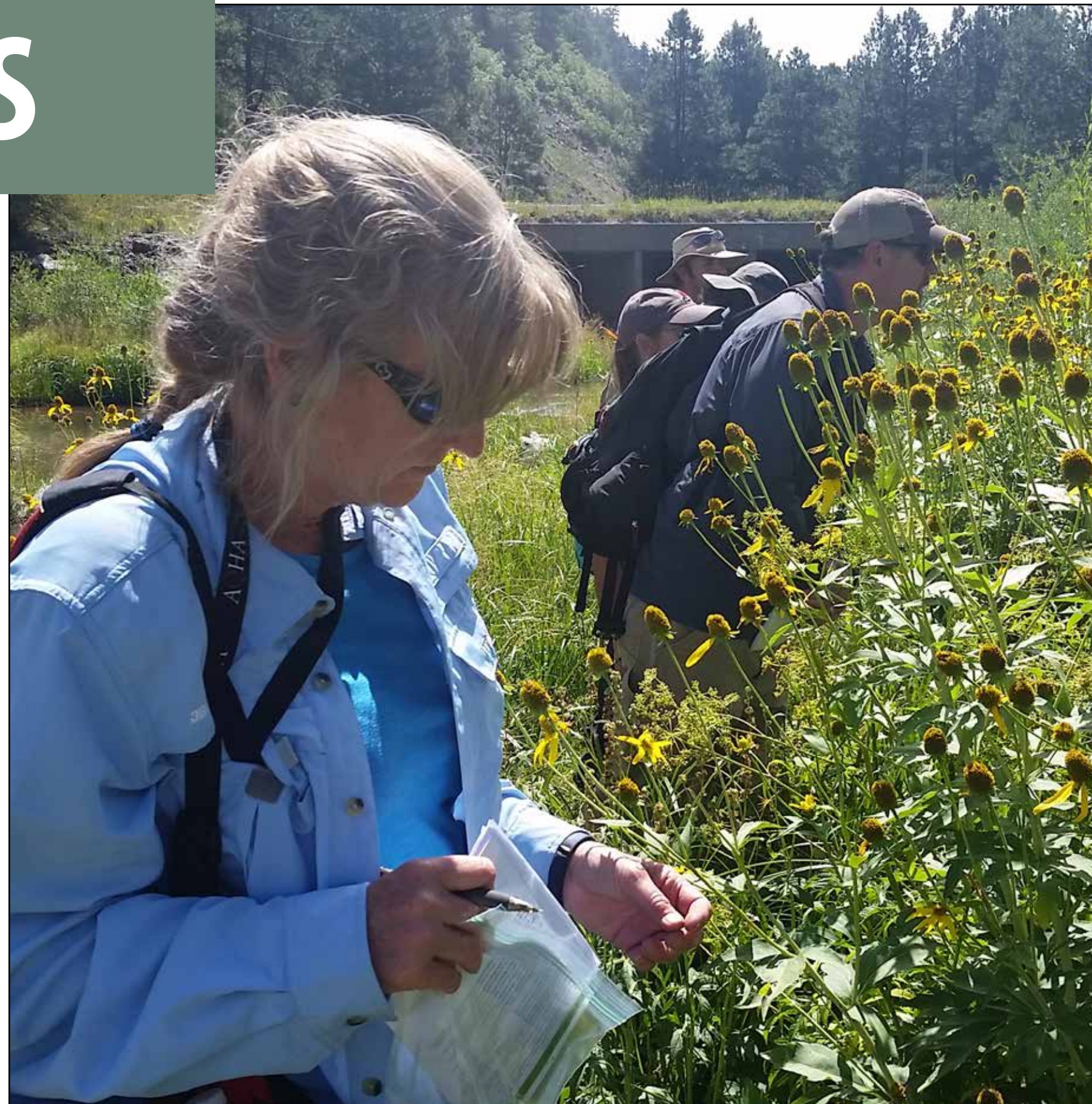
For U.S. Army Corps of Engineers, Albuquerque District regulators, knowing a grass from a sedge is not just a trivial pursuit question. Jurisdictional wetlands are determined in part by what plants are present. In order to protect and restore, it's important to know what's there. Thus, being able to correctly identify wetland plants is critical in making wetland decisions. As part of an ongoing series of collaborated training, the Albuquerque District reached out to other interested state and federal agencies such as the New Mexico Department of Transportation, the New Mexico Environment Department, and the Bureau of Reclamation. Above, one of the class participants puts the training into practice, working on identifying a particular plant, Aug. 17.