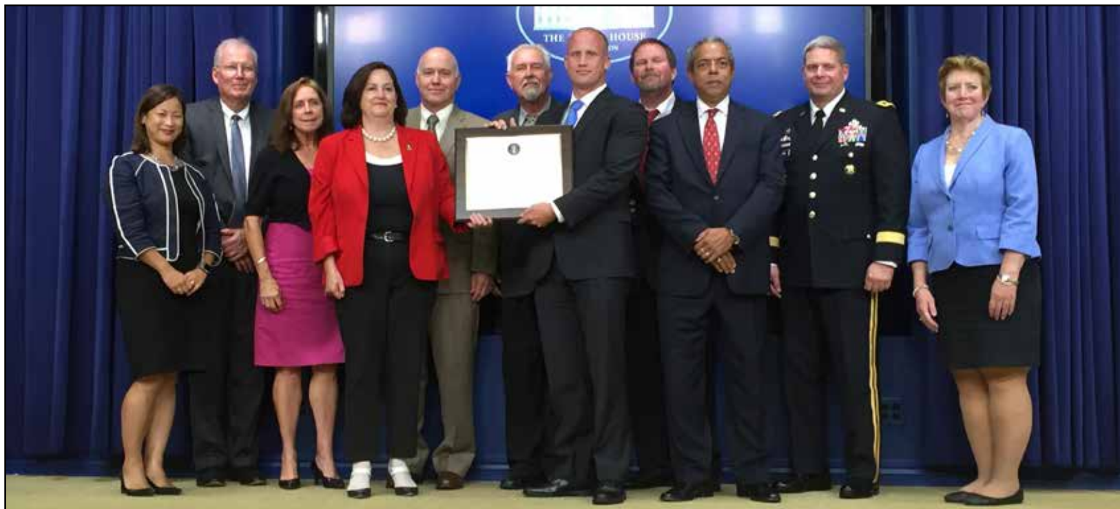
Receiving the Building the Future GreenGov Award on Sept. 7 were employees from the U.S. Army Corps of Engineers Omaha District and the Directorate of Public Works at Fort Carson, Colorado, along with senior leadership from the Department of Defense, Army and U.S. Army Corps of Engineers. The award was presented for the work done at the 13 th Combat Aviation Brigade Aviation Support Battalion Hangar, Fort Carson, Colorado, the first LEED Platinum and Net Zero hangar in the Army.

Detroit District for its Flex Fuel Program encouraging its workforce to use E-85 fuel in its fleet vehicles — the Lean, Clean and Green Award 2015