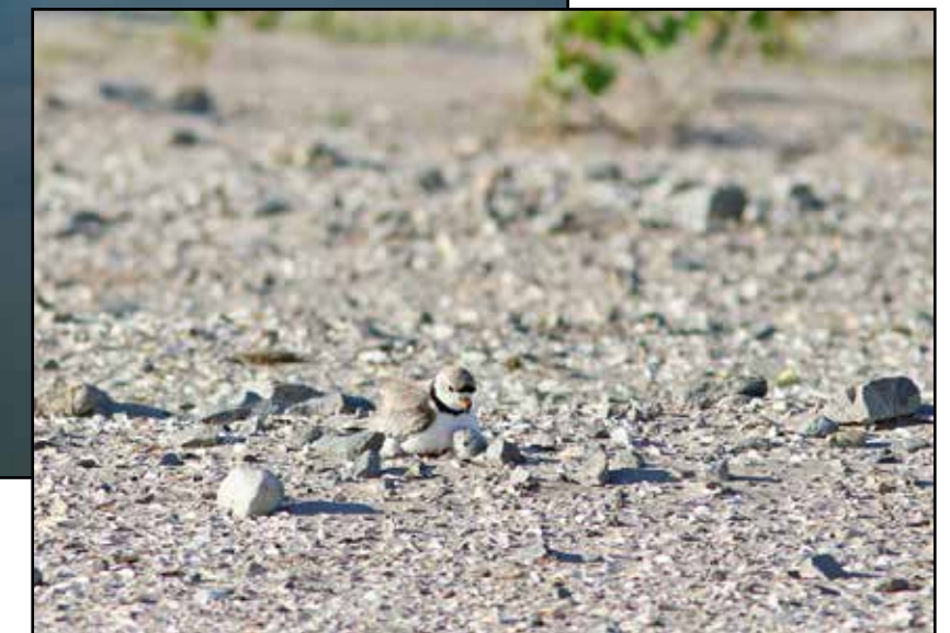
Below: Male piping plover nesting with chick fledged this summer at Cat Island.