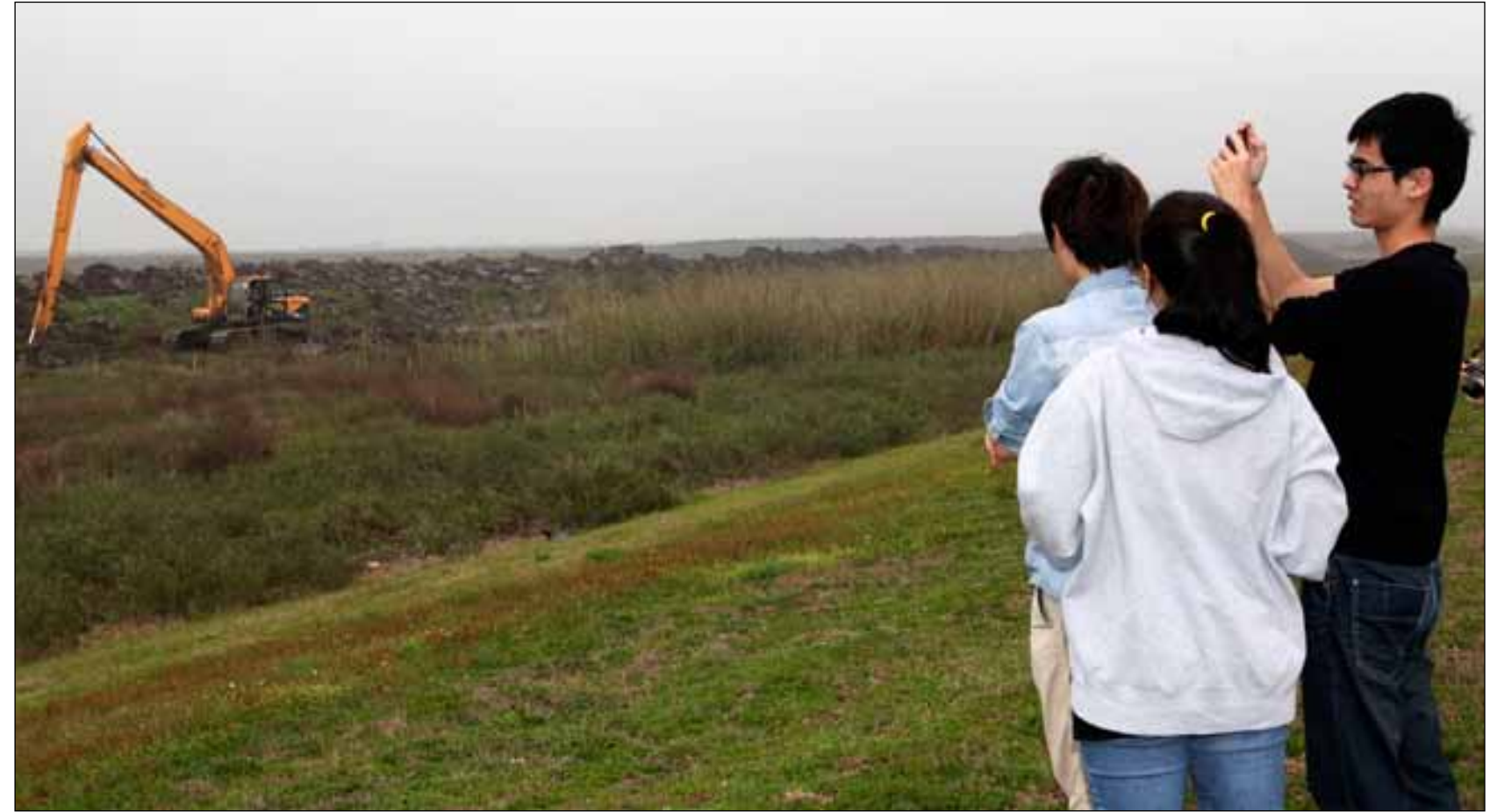
Visiting Louisiana State University students, enrolled in the Robert Reich School of Landscape Architecture, watch a heavy equipment operator work to construct dewatering ditches at the San Jacinto Placement Area to allow for the outflow of excess water and increase the dredging placement area's capacity to hold more dredge material.

"These realizations are key to our current studio project, which is particularly concerned with the potential role of landscape architects in