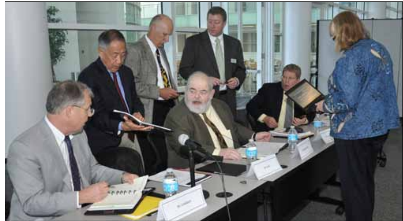
Members of the U.S. Army Corps of Engineers Environmental Advisory Board prepare for a Feb. 15 public meeting. Topics covered included Sustainable Infrastructure for Military Customers, the partnership between the Corps and The Nature Conservancy and the Sustainable Rivers Project with special emphasis on the Alamo Dam-Bill Williams River partnership.

“This office is considered the model for how we can update the structure of Corps offices so we can make