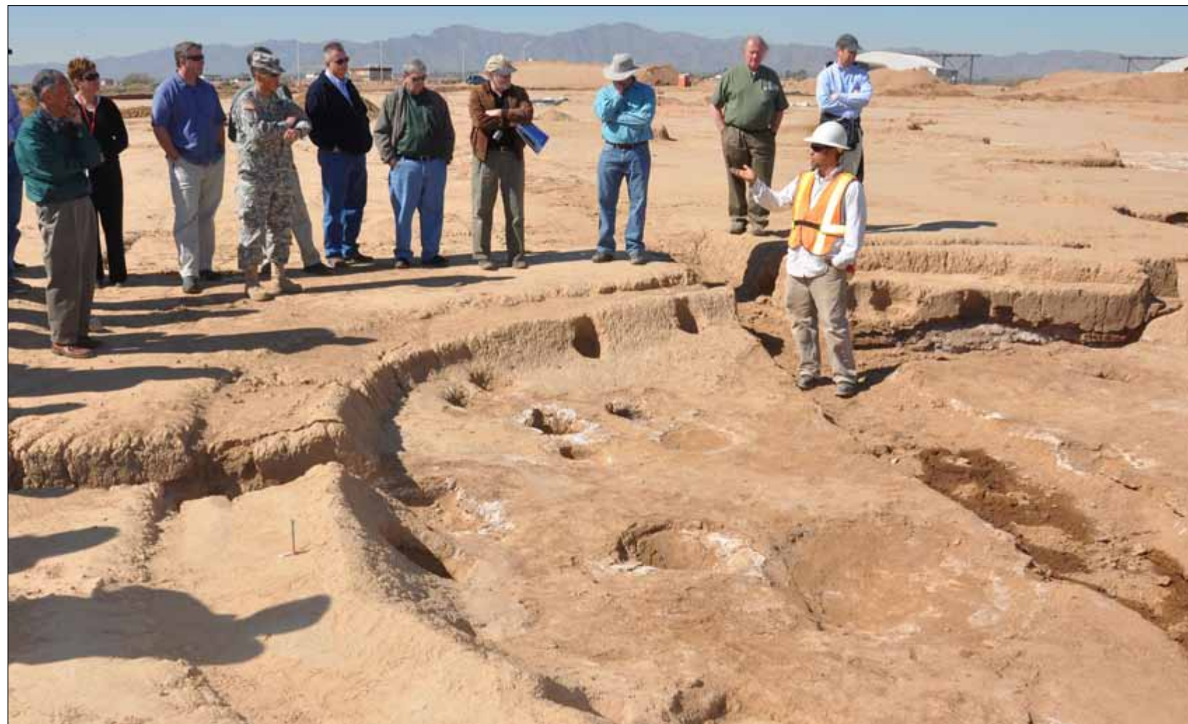
Members of the U.S. Army Corps of Engineers Environmental Advisory Board and USACE officials take the opportunity to see the location of what archaeologists think might be a large community building at the site of an archeological excavation containing human dwellings dating back to 3,000 BC and representing a "seminal period," according to archaeologists conducting the excavation, in human development during their visit to Luke Air Force Base Feb. 14.

"We've been effectively operating this site since