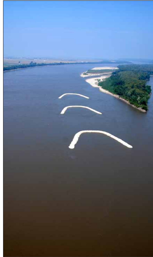
Chevrons like these in the Mississippi River, are a type of river training structure and an example of the Engineering With Nature concept. They are constructed parallel to the river's flow and use the energy of the river to redistribute flow and sediment.

The researchers shared opportunities to pursue projects with these attributes within the Corps' mission, including strategic placement of sediments; use of natural features that reduce navigation channel infilling; enhancing the habitat value of