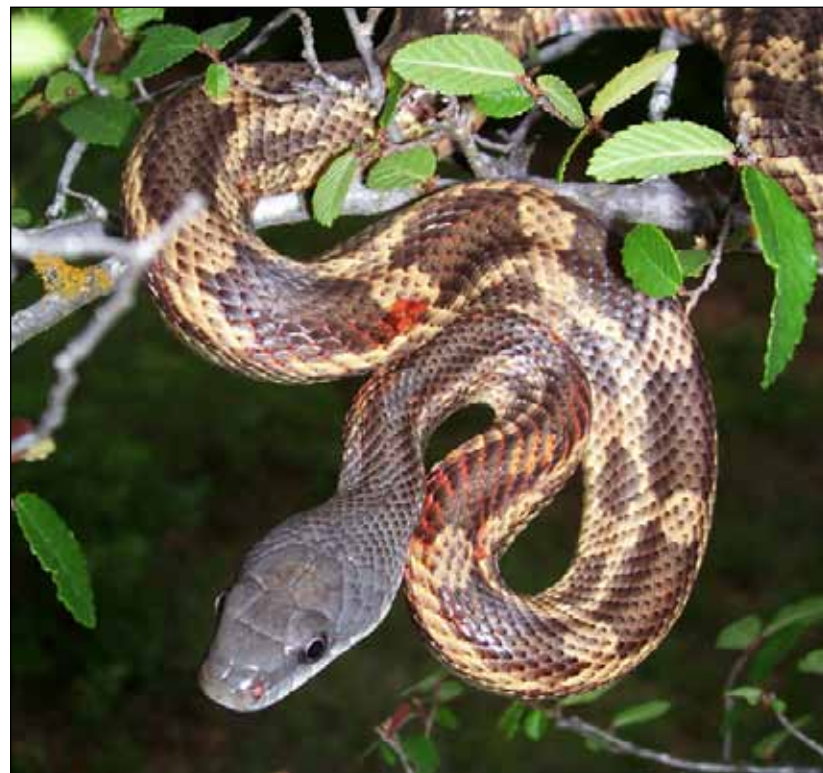
Ratsnakes captured at Fort Hood, Texas, and sites in Illinois and Canada were implanted with temperature sensitive radio transmitters to collect data on their thermoregulation patterns. (Courtesy photo)

In warmer climates like those at Fort Hood, these behavioral changes can have other ecological consequences.