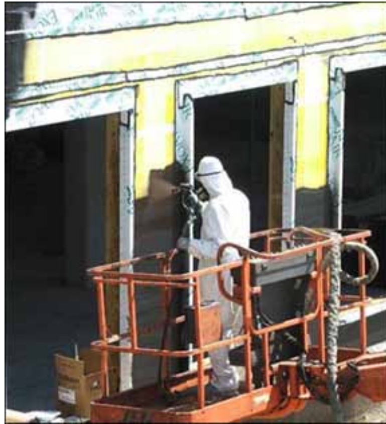
Continuous air barriers like this one being installed can save up to 45 percent on energy costs.

Currently, these model scenarios are on a generic level that take into account standardized Army facility building details to develop a catalog of thermal bridges. The catalog development is in progress and will contain generic Army facility sections having thermal bridge data such as thermally relevant component dimensions/material properties, temperature contour profile with respective psi-value, and guidelines recommending best practices to avoid occurrence of thermal bridging problems.