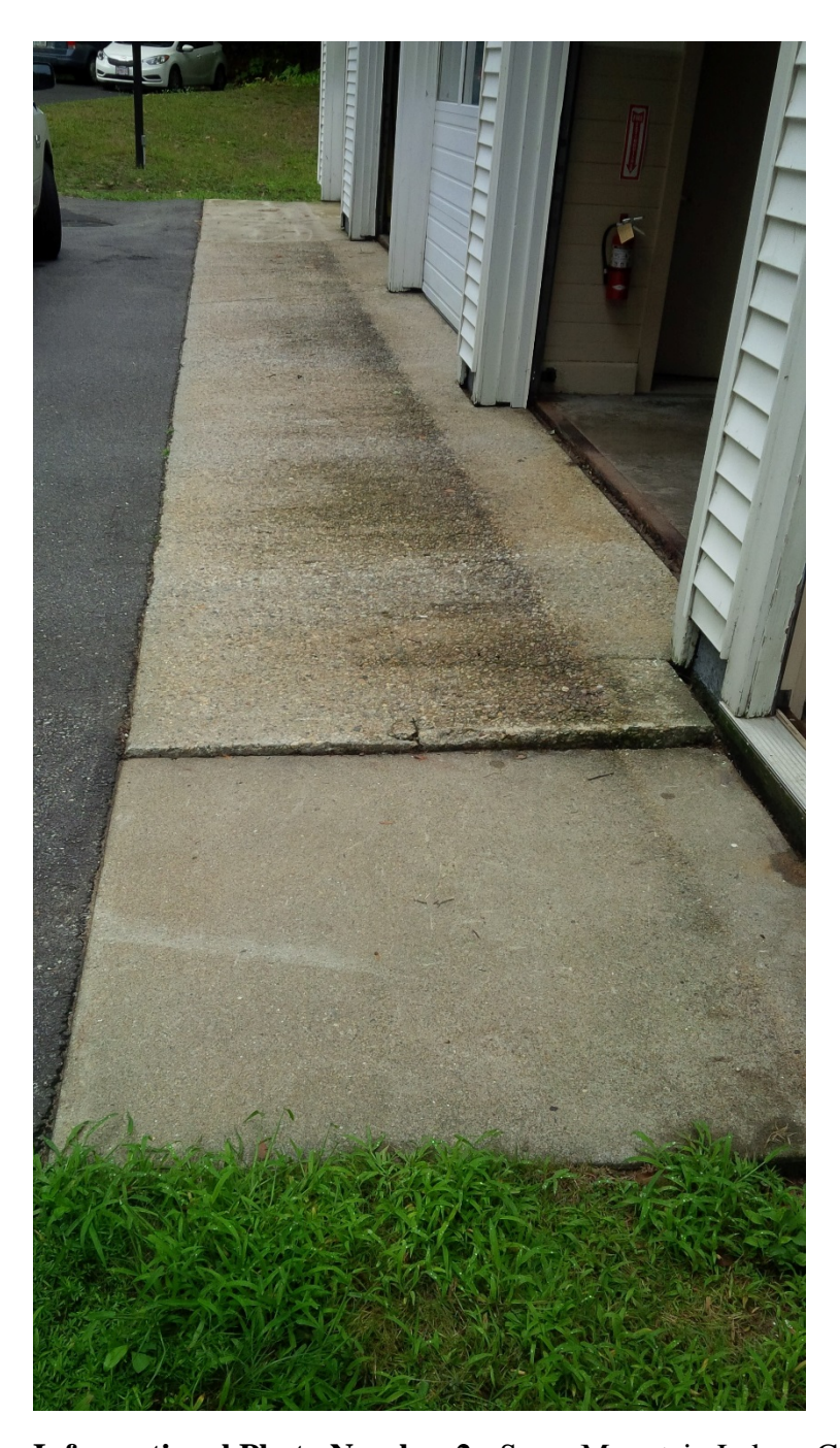
Informational Photo Number 2: Surry Mountain Lake – Current condition of apron