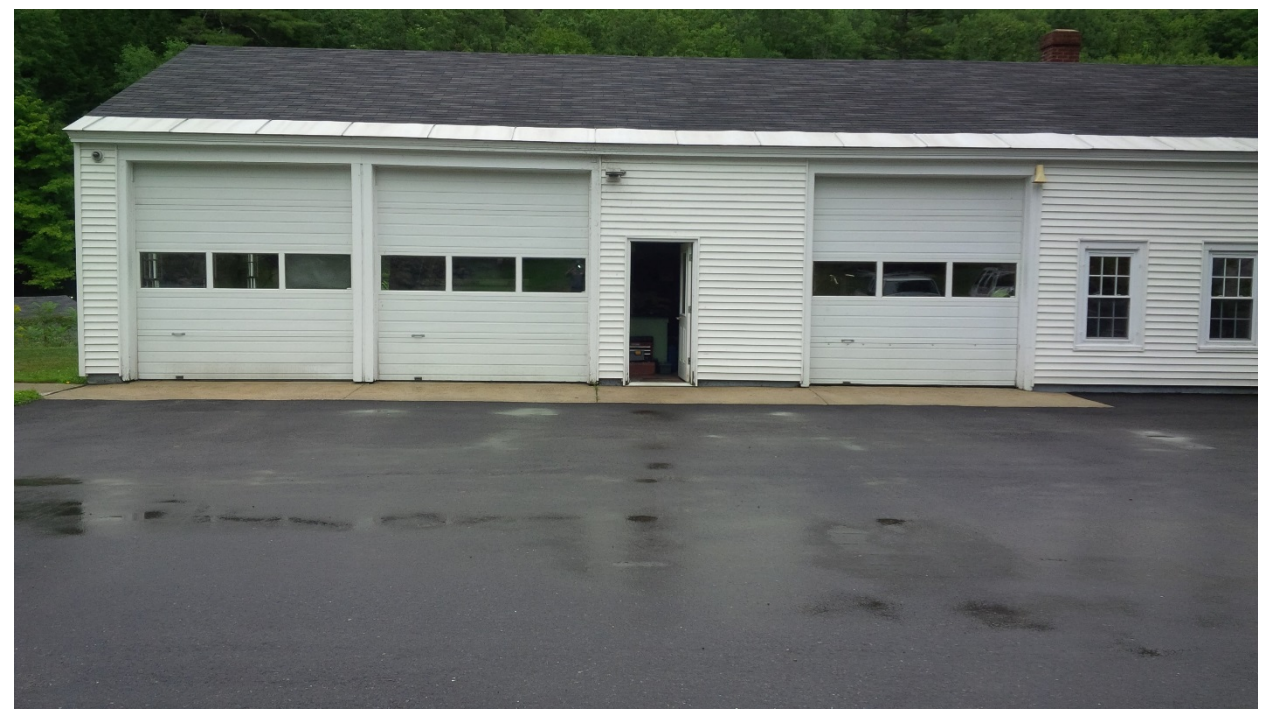
Informational Photo Number 4: Otter Brook Lake – Current condition of apron