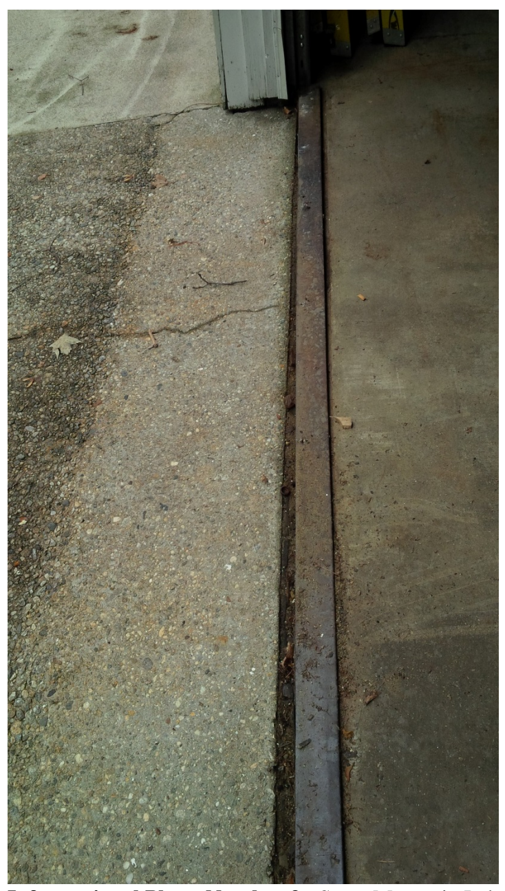
Informational Photo Number 3: Surry Mountain Lake – Current condition of apron