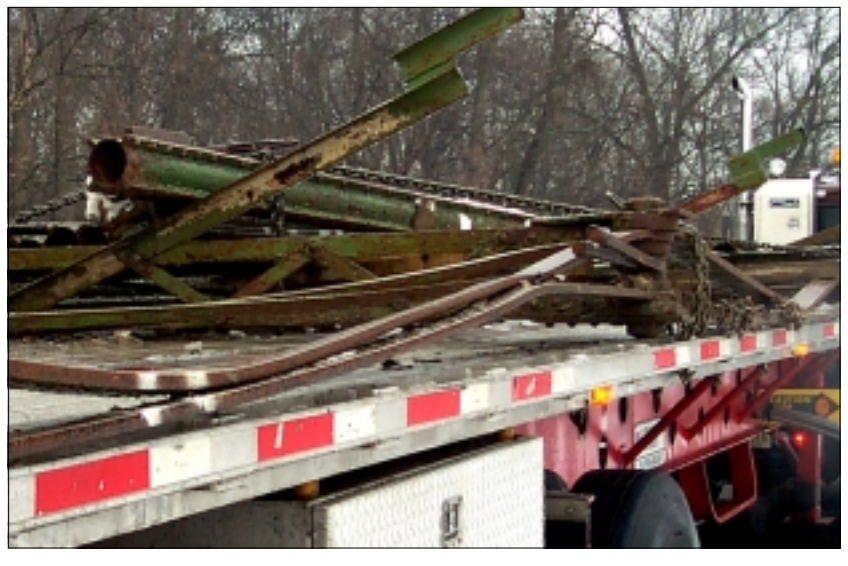
The bridge was disassembled and trucked from Oakland Borough, N.J. to Phoenixville, Pa. where it was crafted over a century ago.

New York District recently found a home for the bridge's trusses in Phoenixville, Pa., where the bridge was originally assembled and where it will continue to serve the public in a local public park. The plans for the park include walking and biking trails along a creek and a bridge will be constructed over the creek that will connect the park to the trails. The Doty Road Bridge trusses will be placed alongside the bridge as a decorative element.