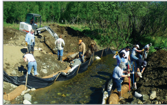
Restoration workshop at Wasilla Creek

In Alaska alone, the Alaska Department of Fish and Game has received over $197 million in PCSRF funds with an additional $53 million in state matching funds.