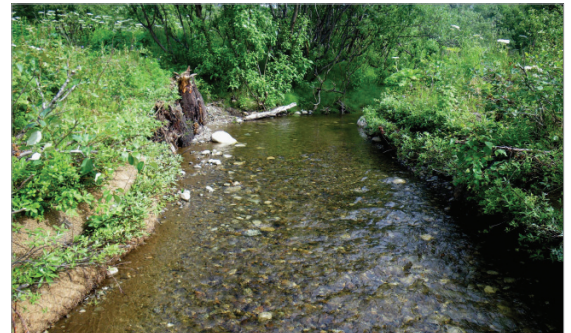
Wasilla Creek after restoration