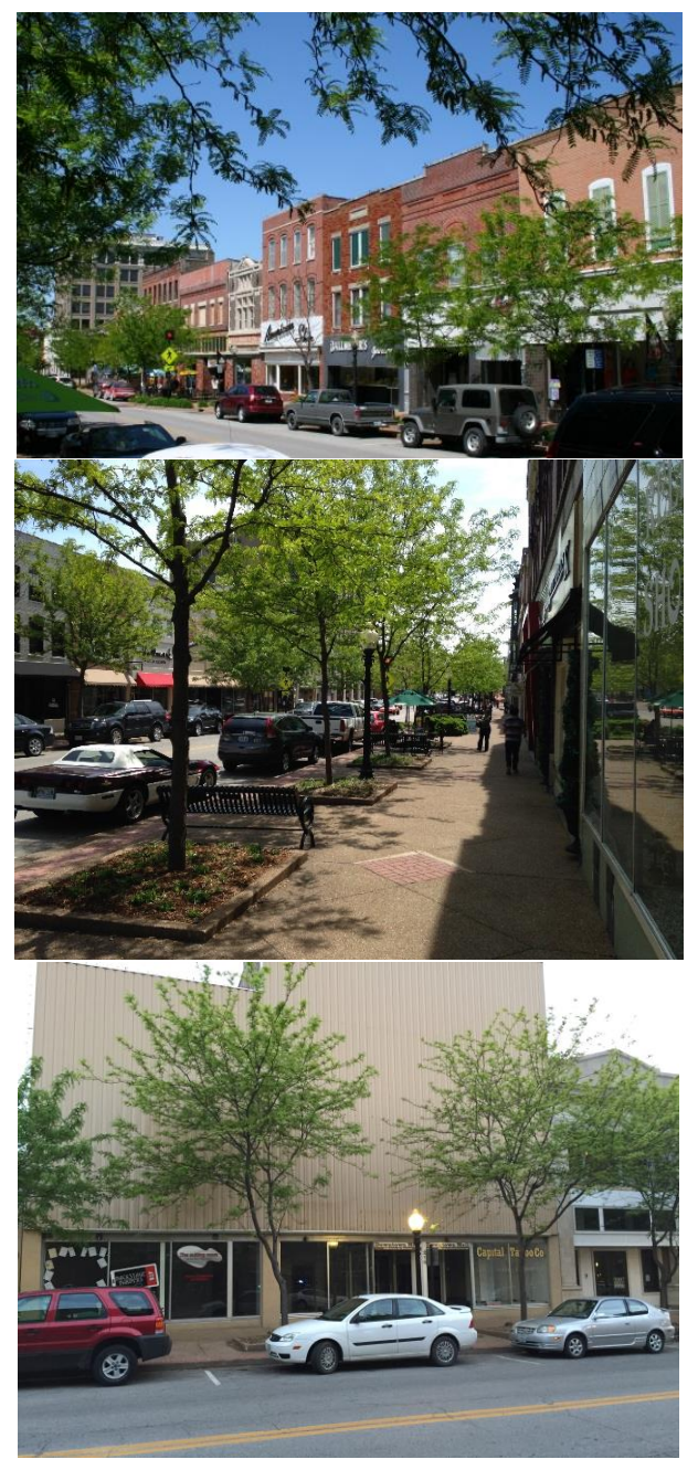
Figure 1 - Photo series from Jefferson City, Missouri.

As a seat of state government, the downtown has enjoyed a stable economic base since its incorporation. However, City leaders have continually challenged to make the City's core more of a vibrant neighborhood—not just a business district. Recent years have brought significant successes in revitalizing the downtown core: in 2013 the City received the distinction of being called the nation's "Most Beautiful Small Town" by Rand McNally. The downtown core is walkable and has an attractive streetscape with generous sidewalks, landscaping, historic buildings, and retail activity. Many of the downtown shops are independently and locally owned businesses. Much of the recent success can be attributed to these local merchants and active civic groups like Downtown Jefferson City, Inc. which seeks to make Downtown a central gathering place for civic life, commerce and entertainment. Current and prospective residents have named access to foods—particularly healthy foods—as one of the largest needs for making downtown livable. Additionally, fresh local food for residents and restaurants downtown is broadly recognized as an important part of the overall revitalization strategy envisioned by the leaders and partners of Downtown Jefferson City, Inc.