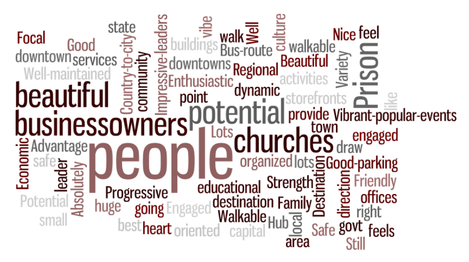
Figure 5 - "This I Believe" about Jefferson City wordle - Exercise Result

The first night of the workshop began with an enthusiastic welcome from the Mayor of Jefferson City, Carrie Tergin. As both an elected official and as a downtown store owner, Mayor Tergin expressed support for the initiatives. The consultant team then introduced the topics and program overview with a short presentation. This was followed by exercises where workshop participants shared core values and beliefs around food system, economic, and downtown development. Values drive aspirations for the future, and voicing these are key to pave the way to the more detailed work of action planning the following day. Two sharing exercises were conducted: first, participants were asked to individually stand and say something they believed about their community and about the local and healthy food in Jefferson City. A word cloud of the exercise results shows the key ideas what the workshop participants value in their City.