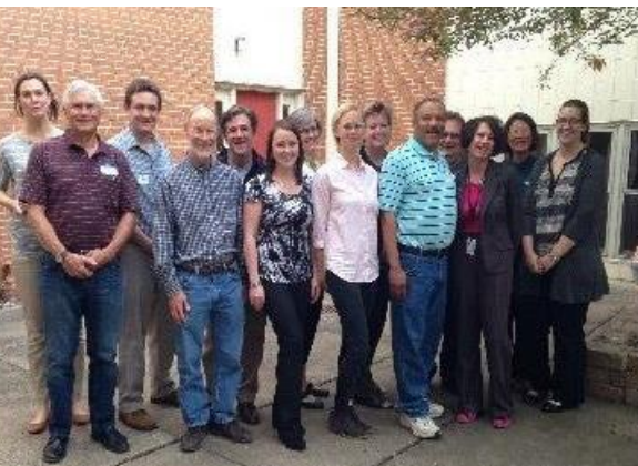
Figure 3 – Action planning (left) Workshop group photo, end of day two (right).

The overall technical assistance process conducted for Local Foods, Local Places has three phases. The tours and the two day workshop are the middle phase. There were a set of calls prior to the workshop and post workshop. The graphic in Figure 4 below illustrates the overall phases of work for the technical assistance process.