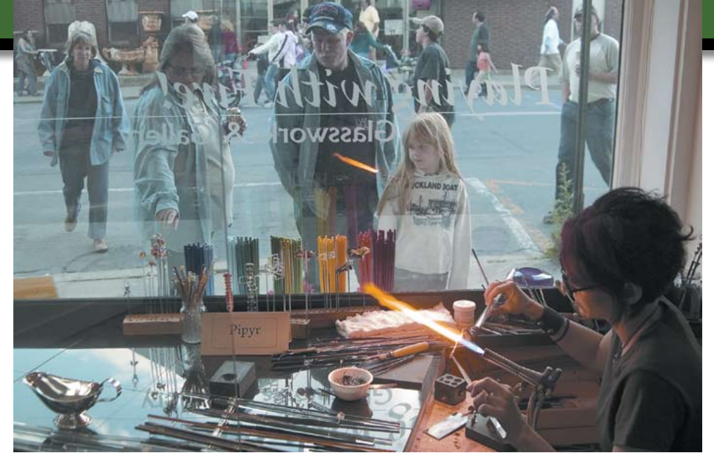
ROCKLAND, ME, DOWNTOWN BUSINESS

used to help create the Piazza Basilone, a public gathering space and war memorial.