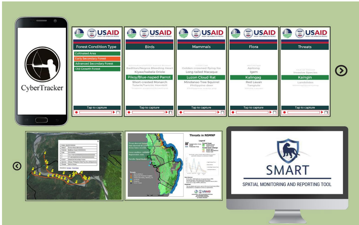
LAWIN applies freely available open-source software including CyberTracker for the data collection interface and the Spatial Monitoring and Reporting Tool (SMART) for data analysis, mapping and report generation. Data can be transferred to Google maps and other tools for creation of actionable reports, which facilitate decision-making.