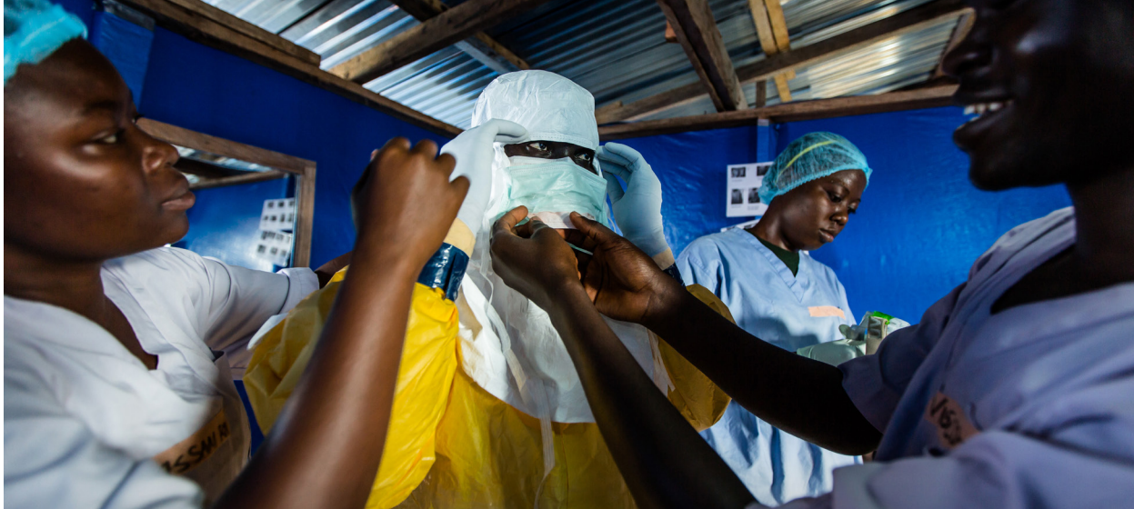
A Liberian nurse prepares to go inside an Ebola patient ward to draw blood from confirmed patients for testing in Bong County, October 2014.