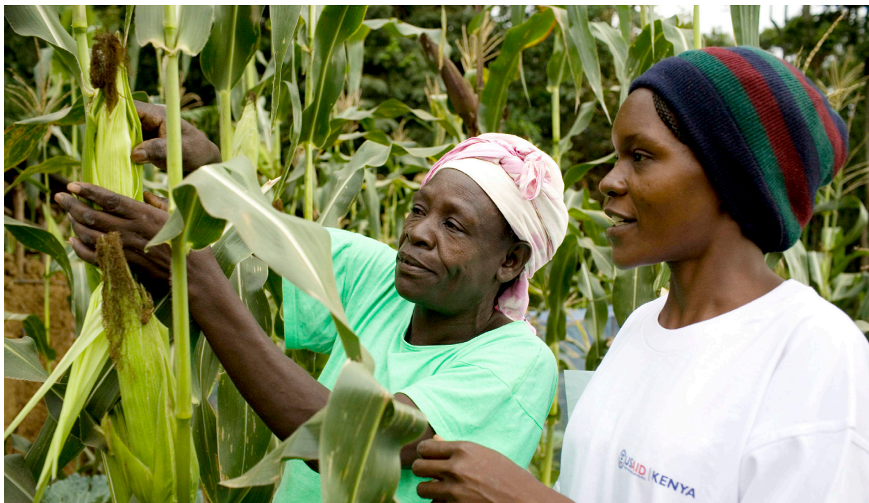
Women inspect maize in Kenya.

Analytical Tools That Aid Decision-Making: USAID invested in the development and use of powerful analytical tools to identify effective approaches to policy change, governance, and decision-making in the food security policy system, which are critical to effecting systemic changes needed to strengthen food security. Some of these tools include the Kaleidoscope model to analyze policies, refinement and application of the Rutgers-Yale public and political will approach, and the application of USAID's political economy tools. These tools were tested in Ghana, Malawi, Tanzania, and Zambia to understand the process related to fertilizer subsidies and micronutrient policy issues.