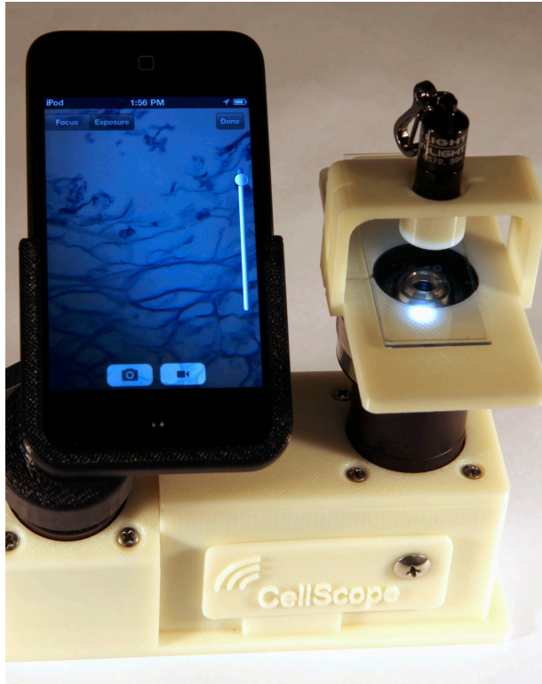
Designed by the Fletcher Lab at the University of California, Berkeley, CellScope transforms a mobile device into a microscope.

Different versions of the easy-to-use device can rapidly capture images of blood, sputum, or other patient samples and perform diagnostic analysis on the phone or wirelessly transmit the data to clinical centers, allowing the patient to be evaluated remotely and treated at the point of care. CellScope is a major step forward in taking clinical microscopy out of specialized laboratories and into field settings for disease screening and diagnosis.