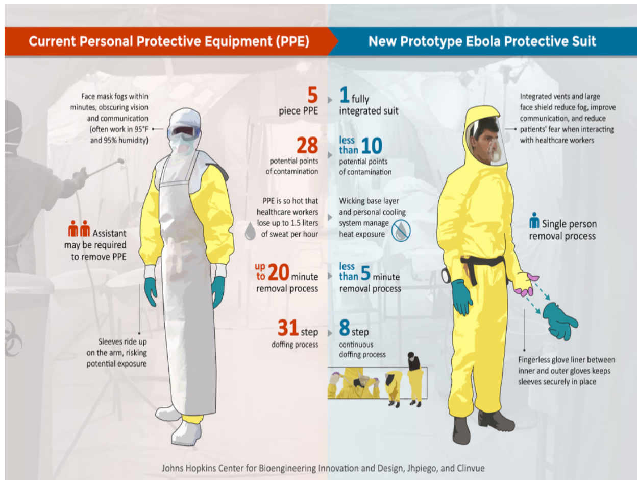
This redesigned personal protective equipment was one of 1,500 ideas generated under the Fighting Ebola Grand Challenge for Development.

such as the areas stricken by Ebola in West Africa, PPE cannot be worn for more than an hour, severely limiting the time health care workers can care for patients. To help workers on the front lines provide better care and stop the spread of Ebola, USAID, in partnership with the White House Office of Science and Technology Policy, CDC, and DOD, developed the Fighting Ebola Grand Challenge for Development—a program that enabled innovators around the world to quickly identify and deliver practical and cost-effective solutions while forging the public-private partnerships necessary to test and scale up these solutions. The challenge generated close to 1,500 ideas, and USAID is now supporting 14 of these identified for their potential to reinforce the response to current and future outbreaks. Some of the most promising include: redesigned PPE; a low-cost, battery-powered infusion monitor that delivers intravenous fluids with precision to patients; and state-of-the-art, easy-to-assemble decontamination chambers.