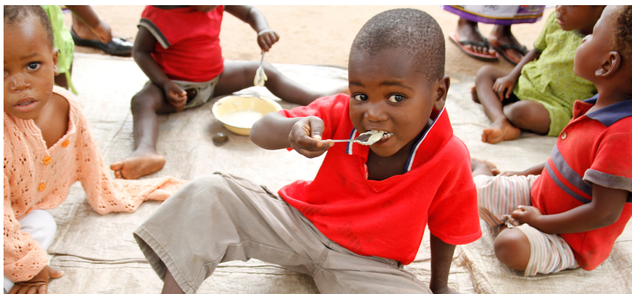
USAID works to boost nutrition in Malawi.

Rift Valley Fever is an infectious disease of livestock across Africa that can be fatal in humans and livestock. It is a trade barrier for livestock exports, which can have significant effects on jobs and livelihoods. The Innovation Lab for Rift Valley Fever Control in Agriculture is developing a vaccine, already known to be safe in humans, which will provide lifelong immunity for livestock in areas affected by the disease. Researchers are also exploring a needle-free delivery system to improve the ability to do widespread vaccine delivery. This project represents a collaborative effort between the University of Texas at El Paso, University of Texas Medical Branch at Galveston, Sokoine University of Agriculture in Tanzania, and MCI Sante Animale, a private animal vaccine company based in Morocco.