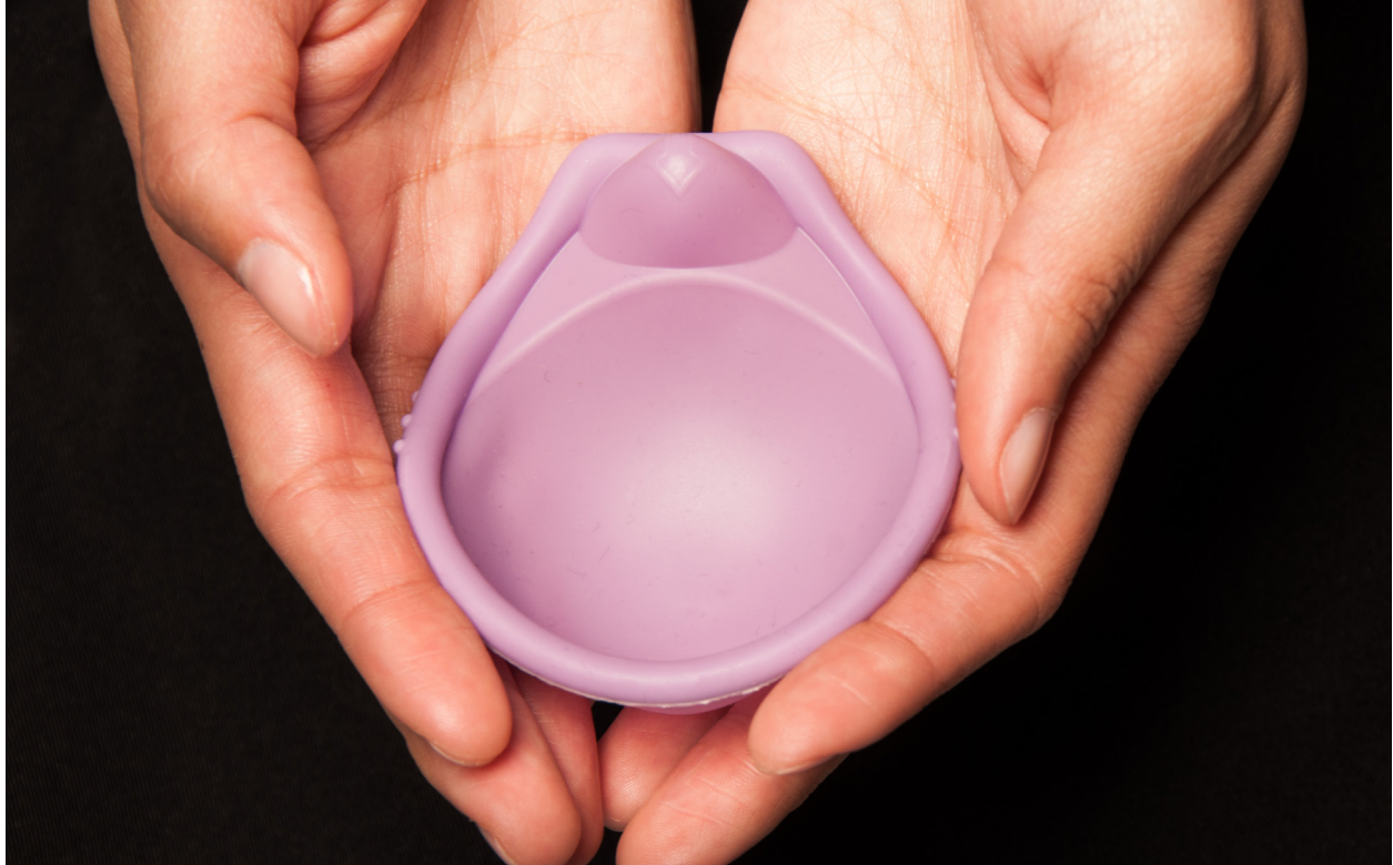
The SILCS diaphragm is a nonhormonal contraceptive developed through a user-centered process to be easy to use and comfortable for both partners. The single-size design makes this reusable barrier simple to supply and provide. SILCS is marketed as the Caya® contoured diaphragm in more than 25 countries; work is underway to bring this new product to low resource settings.

Treating Newborns: Infections in newborns, which can rapidly progress to life-threatening conditions, can be effectively managed with timely treatment with antibiotics. Infections are among the leading causes of newborn death in developing countries, accounting for 420,000 deaths each year. Studies in South Asia and Africa document that 68 to 98 percent of families do not or cannot access hospital-based inpatient care. USAID and partners supported research that demonstrated the safety of a combination of injectable and oral antibiotics delivered by trained health workers in lower-level health facilities. Drawing on this research, a newly released WHO policy recommends hospitalization as best, but also advises governments that newborns can be safely treated with antibiotics as outpatients. Ongoing implementation research and evaluation is guiding safe introduction of these treatments in countries such as Bangladesh.