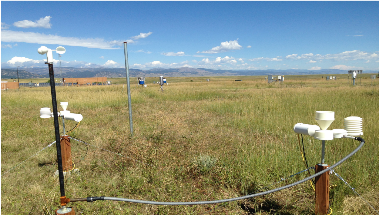
This 3-D-printed weather station will help developing countries forecast weather-related disasters and save lives.