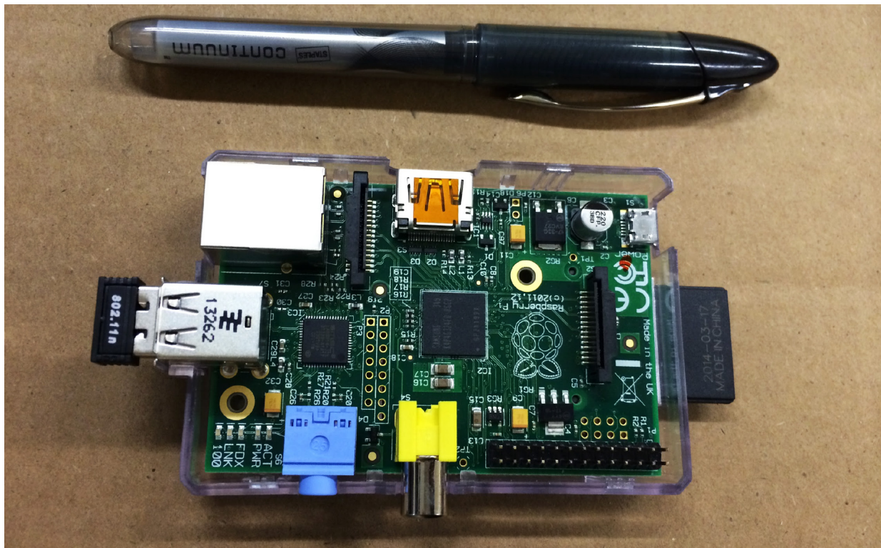
Raspberry Pi, a computer the size of an iPhone, can hold a year's worth of weather information collected from a 3-D-printed station.

USAID's Bureau for Europe and Eurasia, in recognizing the need for greater civic engagement, worked with the Georgian Government to design an e-petition system (known as iChange) that is customized for the Georgian context. Per iChange regulations, a petition that gathers 5,000 signatures in a 30-day period compels the government to consider the matter and publish an official response. If used effectively, iChange offers the Government of Georgia an opportunity to solicit innovative ideas from the citizenry and to keep its finger on the pulse of public sentiment.