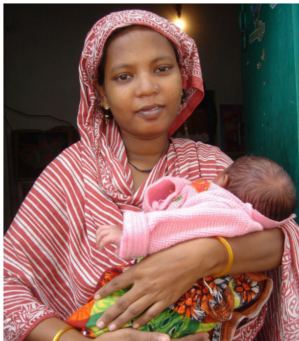
PATH Chlorhexidine staff met this mother and her baby as part of a field trip in Bangladesh. Clean birth practices including use of chlorhexidine, can protect babies such as this one born at home in Kamrangirchar, one of the largest slums in Bangladesh.

Services: Abuse and disrespect during maternity care have been documented and observed around the world. Women who choose to give birth at home without a skilled health care provider because they have experienced or heard about abuse and disrespect are more likely to suffer complications, as are their newborns. A research study in Kenya, drawing on host-country leadership and parallel advocacy, led to a 35-percent reduction in disrespectful maternity care. It also spurred development of a World Health Organization (WHO) statement on the prevention and elimination of abuse and disrespect during facility-based childbirth. Evidence gathered from these studies is driving scale-up efforts in Tanzania and Kenya, with active engagement and interest from several other countries.