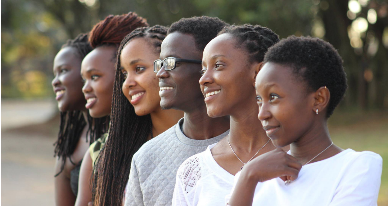
Students at the African Leadership Academy.