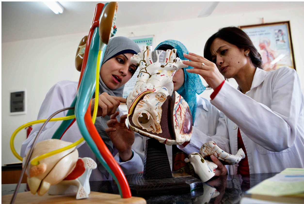
Biology students study a heart.

Innovations in Desalination: MIT and Jain Irrigation Systems designed a photovoltaic-powered electro dialysis reversal (EDR) system that desalinates water using electricity to pull charged particles out of the water and further disinfects it using ultraviolet rays. The system was designed for low energy consumption, limiting costs especially in off-grid areas. With USAID and UNICEF support, this system is being piloted in the Palestinian Territories. The goal is to provide scalable, efficient, and sustainable water solutions for irrigation and potable drinking water. The activity will result in new water provision technology as well as the engineering knowledge required to adapt and scale the technology for various environmental conditions and geographic regions.