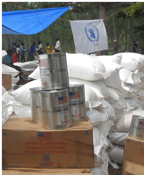
Vegetable Oil fortified with Vitamins A and D is ready for distribution to conflict-affected families in the Democratic Republic of Congo.

USAID's Famine Early Warning Systems Network (FEWS NET) activity represents one of the longest-running and most successful examples of interagency collaboration in the U.S. Government, involving NASA, NOAA, USDA, USGS and USAID. For 30 years, the FEWS NET team has been applying science, technology, innovation, and partnerships (STIP) to inform and guide more than $2 billion annually in specific, complex, and lifesaving food security and humanitarian assistance operations of the U.S. Government and other national, regional and international partners around the world. Much of FEWS NET's early STIP work centered on applying U.S. satellite resources to identify hot spots of human suffering associated with agricultural drought. With time and greater experience, and in response to new challenges in hunger and vulnerability, the emphasis has shifted to answering more fundamental and complex questions about the nature of climate change, causes and frequency of drought, and localized trends in water availability. Especially notable in all these efforts is the growing number of instances where a global set of partners has been brought together to form the most effective platforms to assess and address such fundamental issues, such as the monthly Crop Monitor for Early Warning produced under the auspices of the Group on Earth Observations.