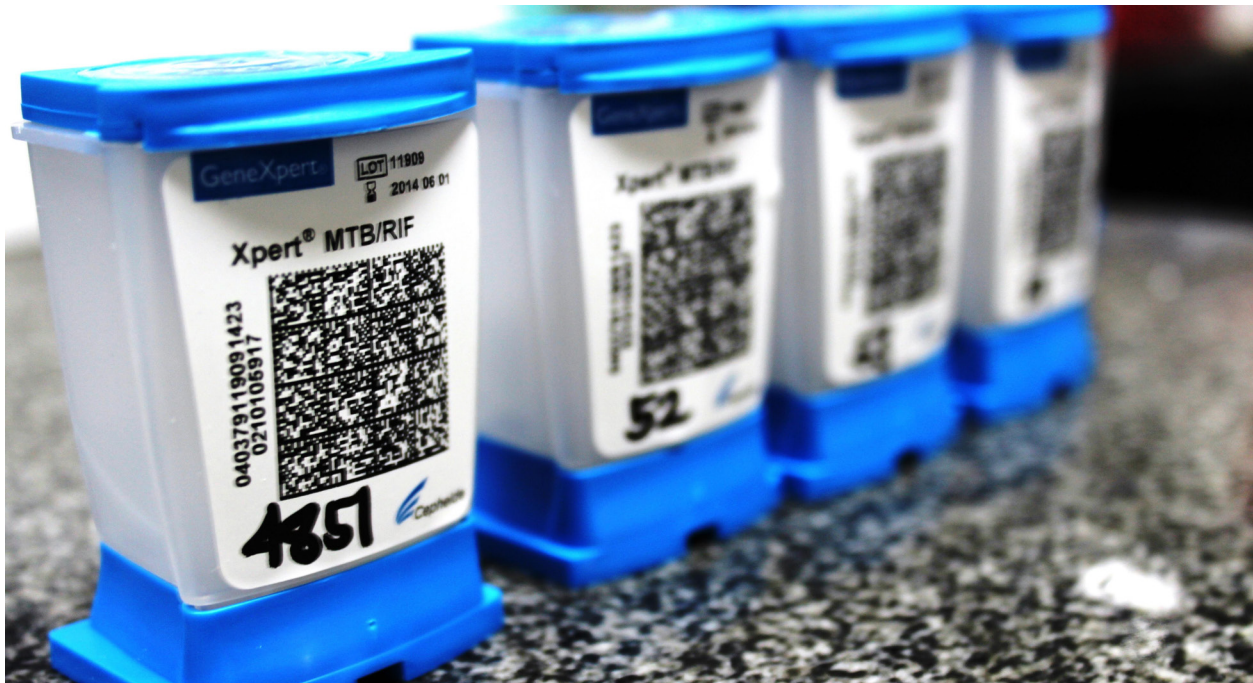
GeneXpert® is a revolutionary diagnostic tool that can rapidly detect TB resistance to rifampin, one of the most potent drugs that treats TB.