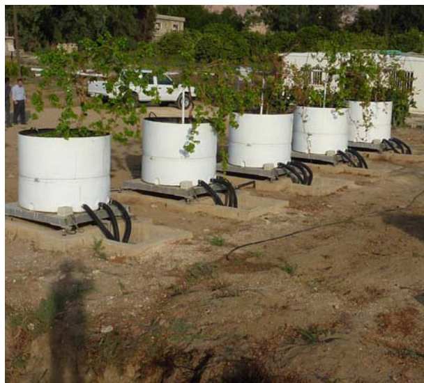
Lysimeter experiments in Jordan used by MERC scientists to minimize agricultural water use requirements.

Improved Water Resources: MERC researchers discovered widespread high levels of naturally