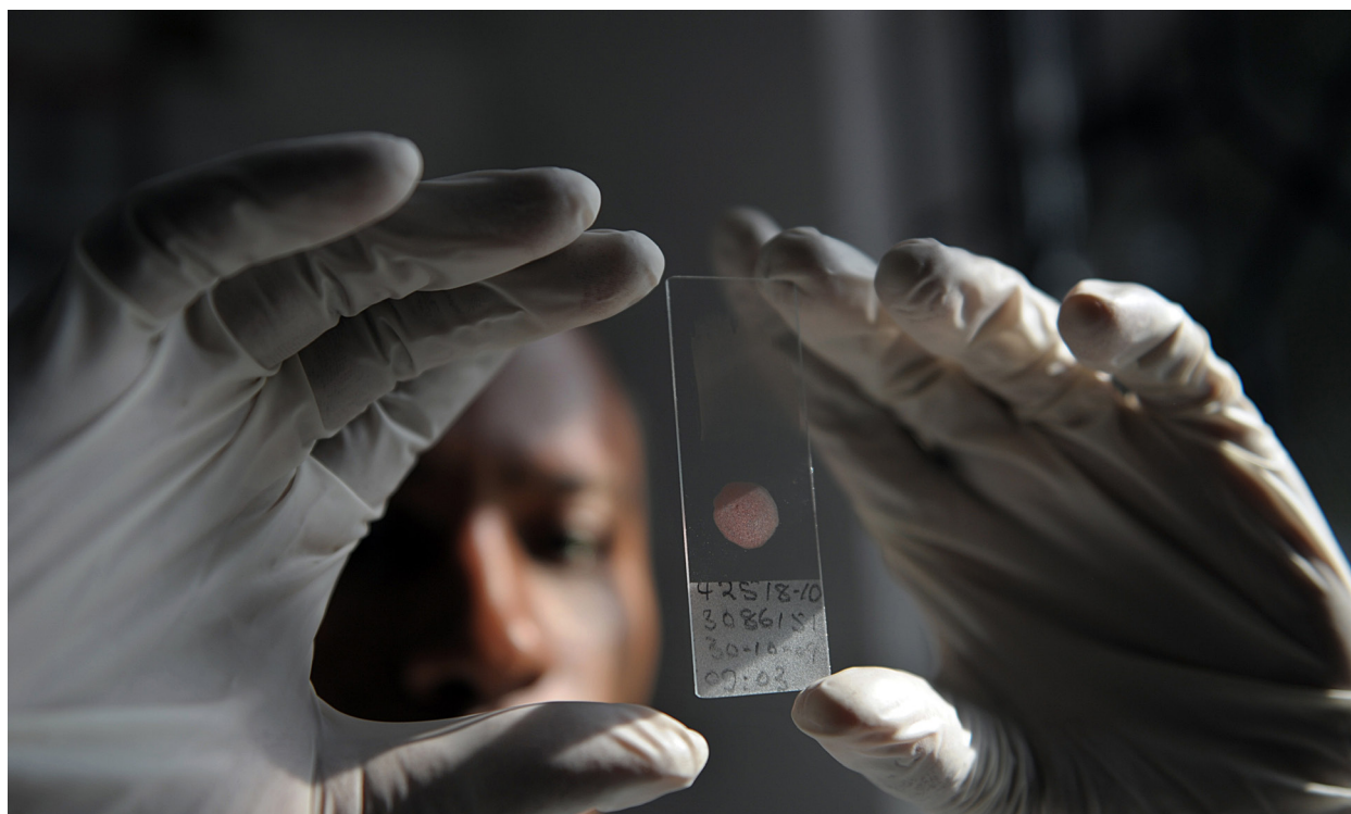
A researcher analyzes a malaria smear.

Violence Against Children Survey: This research is the only national population-based survey that assesses current and previous experiences of violence against children and violence against girls. The research also identified potential risk and protective factors, and enables analysts to link exposure to violence with important health outcomes such as HIV/AIDS in ways that have not been undertaken previously, which is very important for a country that has a high HIV prevalence such as Botswana. Currently, the connection between gender-based violence and Botswana's enormous HIV/AIDS epidemic is becoming clearer. Women in Botswana who experience gender-based violence are 50 percent more likely to be infected with HIV than women in nonviolent relationships, making gender-based violence an important driver for the spread of HIV/AIDS.