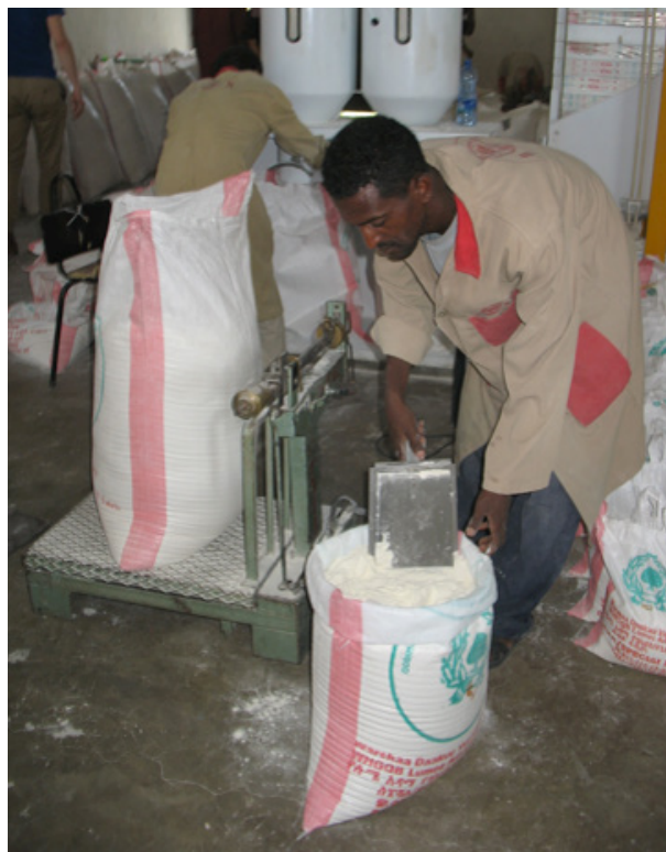
Researchers from the Feed the Future Innovation Lab for Climate Resilient Chickpea visit the Agro Prom chickpea processing facility in Adama, Ethiopia. Thanks to a $164,000 innovation grant from the Ethiopia Mission's Agriculture Market Development project, local private-sector partner Agro Prom was able to acquire the processing plant, including seed cleaning and processing equipment to produce chickpea-based products. By better understanding the needs of local market actors like Agro Prom, Chickpea Innovation Lab researchers will be able to develop new, demand-driven technologies that meet the needs of Ethiopian chickpea producers and processors.

Food Security R&D activities engage a range of partners such as international agricultural research centers, including the multilaterally funded Consultative Group on International Agricultural Research (CGIAR), U.S. universities (through investments known as Innovation Labs), U.S. Government agencies, advanced research institutes outside the United States, and private sector partners. USAID engages CGIAR as a critical partner to link advanced public and private research institutions around the world to crosscutting issues in agricultural development. For example, through the Mexico-based International Maize and Wheat Improvement Center (known by its Spanish acronym, CIMMYT), USAID and other U.S. partners are collaborating with experts globally to develop heat-tolerant maize and pest-resistant wheat. Strategic research