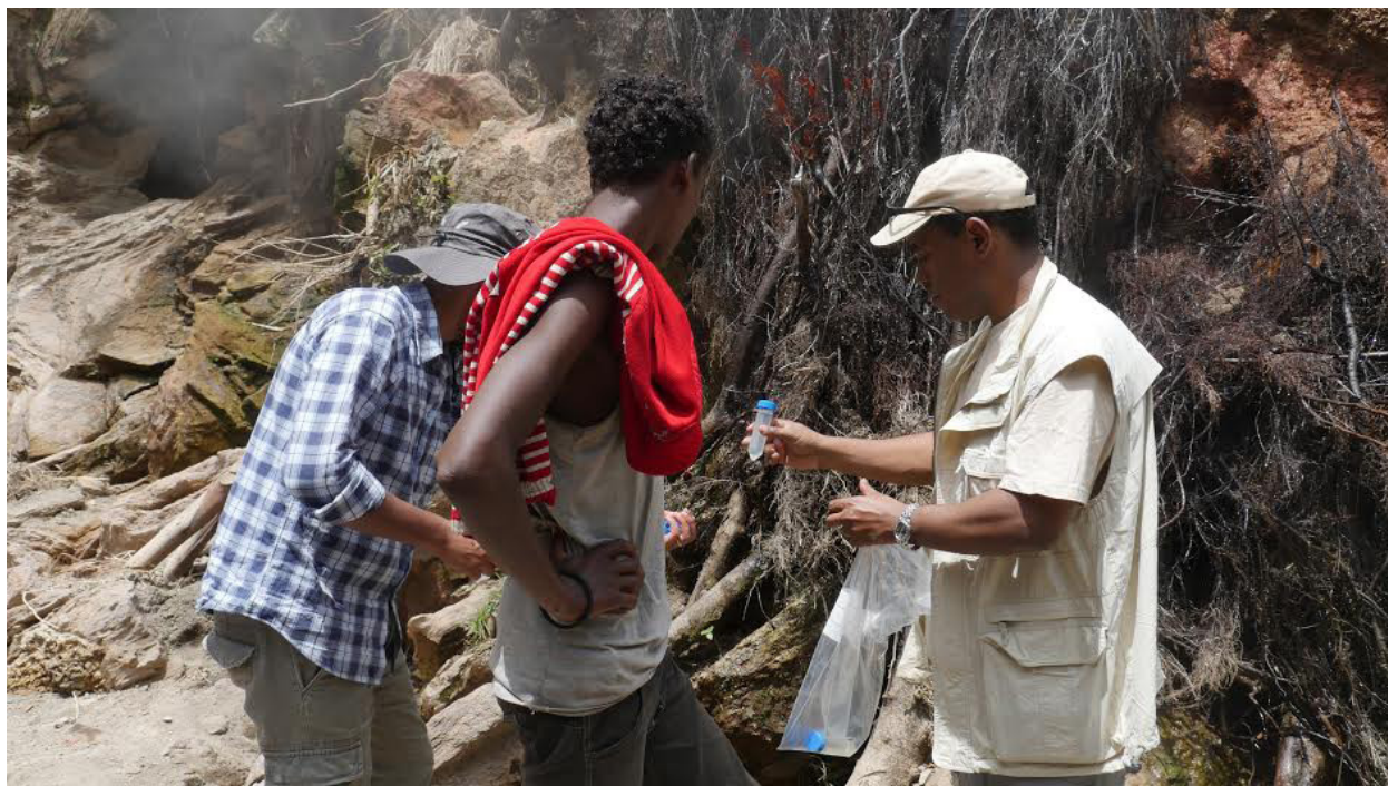
The Partnerships for Enhanced Engagement in Research (PEER) program is an international grants program that funds scientists and engineers in developing countries who partner with U.S.-Government funded researchers to address global development challenges.

USAID brought together seven core university partners to form the HESN: University of California, Berkeley, Texas A&M University, Massachusetts Institute of Technology, Duke University, College of William and Mary, Makerere University (Uganda), and Michigan State University. The network now spans more than 60 countries and 700 organizations, including higher education institutions, commercial enterprises, and nongovernmental and government entities. Since the beginning of the award, the HESN Development Labs have collectively leveraged more than $45 million in funding from other universities, the private sector, NGOs, civil society organizations, and foundations.