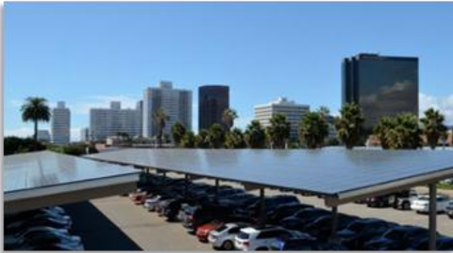
Figure 1. PV installation.

as CHP allows VA facilities to "island" themselves from the power grid and to continue operations during outages. Renewable technologies such as solar panels can complement back-up generators, extending capacity and the amount of time that VA facilities can operate during emergencies.