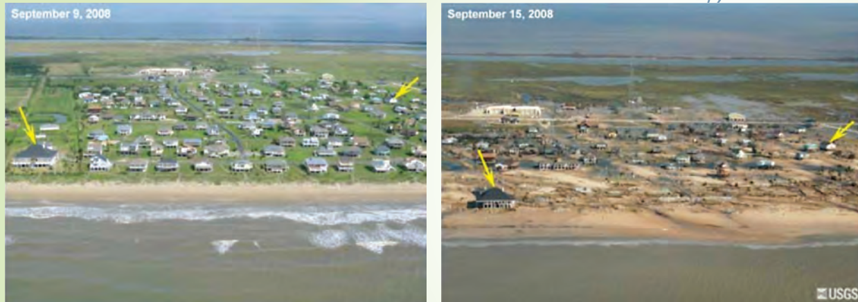
FIGURE 4: Shoreline Before and After Hurricane Ike (Galveston, Texas)

These photos show the movement of the vegetative line before and after Hurricane Ike.