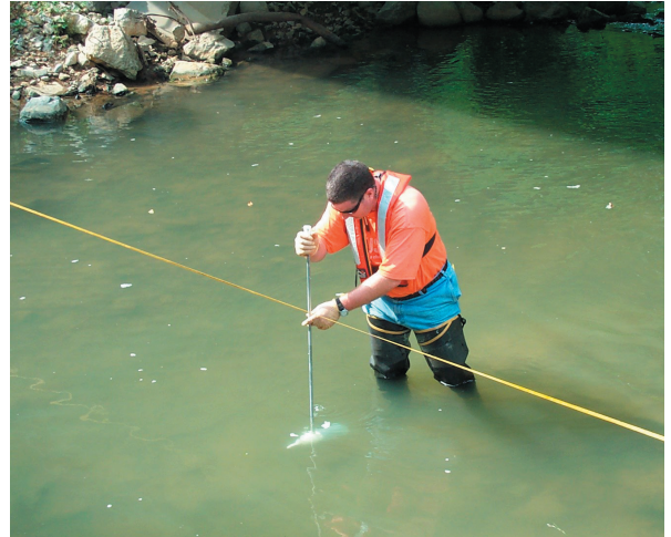
Hydrologist collecting a water-quality sample in an urban stream near Birmingham