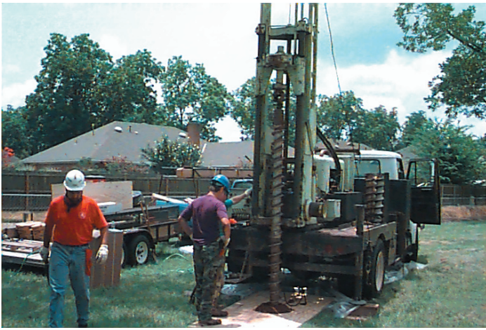
Drilling and installing ground-water monitoring wells in Montgomery