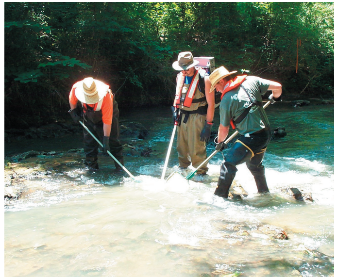
Fish sampling in Cahaba Valley Creek near Pelham