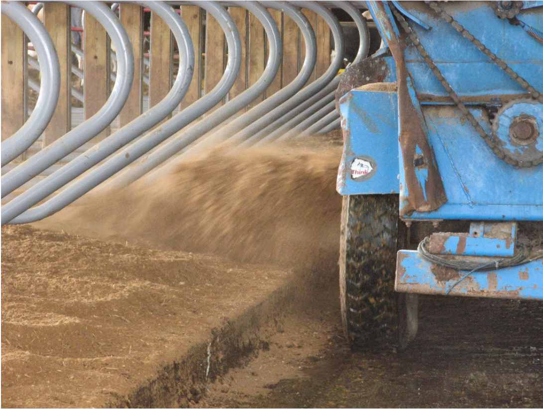
Applying separated solids as bedding.