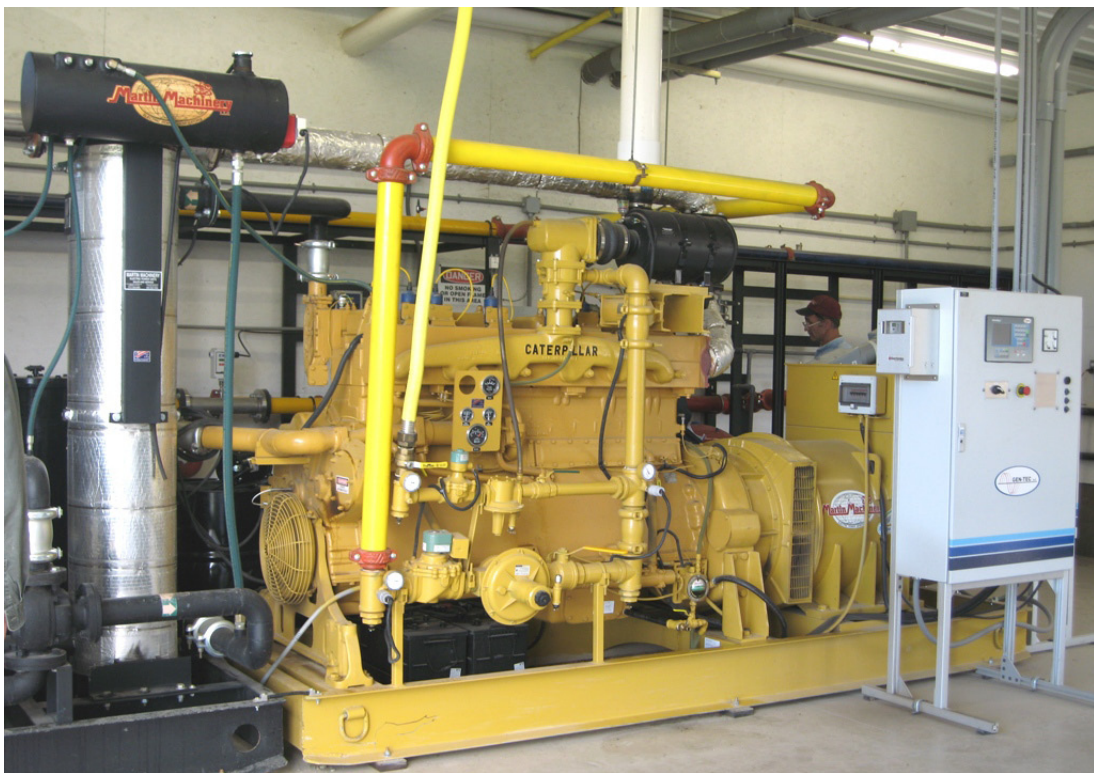
G342 Caterpillar, 1200 rpm engine with 250 Volt, 1 phase generator.