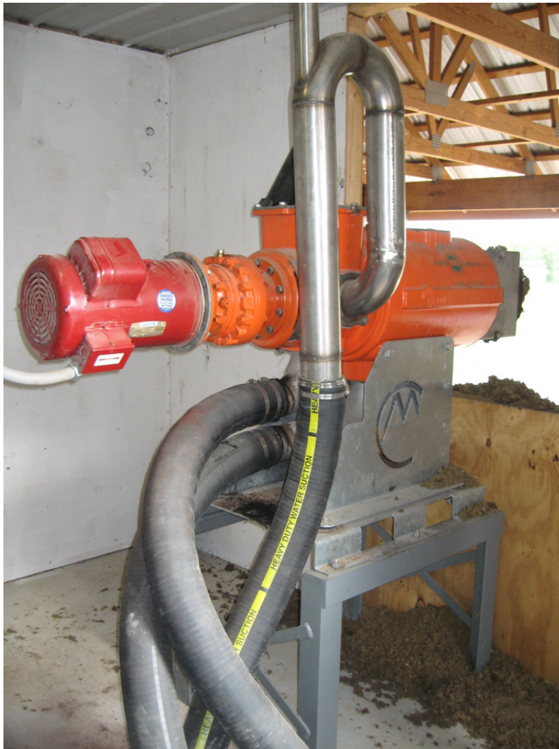
Cri-Man solid/liquid manure separator distributed by Alpha-Bio Systems, Inc.

The nearly odorless digested manure flows to an effluent storage pit measuring 20' L x 20' W x 12' D. A Houle (Baldor Farm Duty Motor) 7.5 hp pump directs the effluent to the solids separation building. The solid/liquid separation room is above the separated solids storage bay. A Cri Man manure separator, distributed by Alpha Bio Systems, Inc., with a 5 hp motor is used. The solids fall directly into the digested solids storage bay. These separated solids are then used as bedding for the cows. Only half of the separated solids are needed for use on the farm, the remaining 50% is sold to nearby farms. The herd somatic cell count has had a continuous lowering trend since the use of separated solids for bedding. Counts now range between 120,000 – 150,000. The separated liquid effluent gravity flows to the 2.5 million gallon storage pond. The effluent is stored and applied by both drag hose and tanker haul twice a year to crop fields.