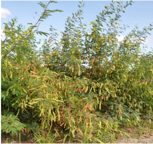
Rio Grande Germplasm prairie acacia.

A Conservation Plant Release by USDA NRCS E. "Kika" de la Garza Plant Materials Center, Kingsville, TX