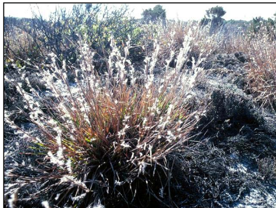
Dune Crest Germplasm coastal little bluestem ( Schizachyrium littorale (Nash) Bickn.) is source-identified germplasm released from the Cape May Plant Materials Center in Cape May, NJ in 2007.

Dune Crest Germplasm coastal little bluestem is a source-identified germplasm released by the Cape May Plant Materials Center, Cape May NJ, in 2007.