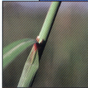
Indiangrass ( Sorghastrum nutans )

Spreads by short rhizomes, somewhat bunchy, 3 to 6 feet tall