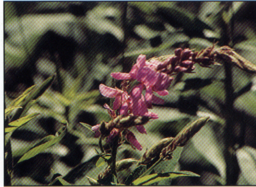
Canada Tick Trefoil 1-5' tall, blooms July-August, moist sites, 4,500 seeds/oz ( Desmodium canadense )