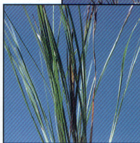
Little Bluestem ( Schizachyrium scoparium )

Strong bunch grass Grows 2 to 4 feet tall