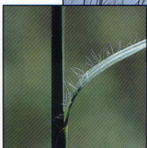
Big Bluestem ( Andropogon gerardii )

Spreads by short rhizomes Somewhat bunchy Grows 6 to 9 feet tall