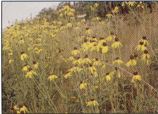
Yellow Coneflower 2-5' tall, blooms July-Sept., dry to moist sites, 27,000 seeds/oz ( Ratibida pinnata )

2-3' tall, blooms May to June, medium to moist sites, 1585 seeds/oz.