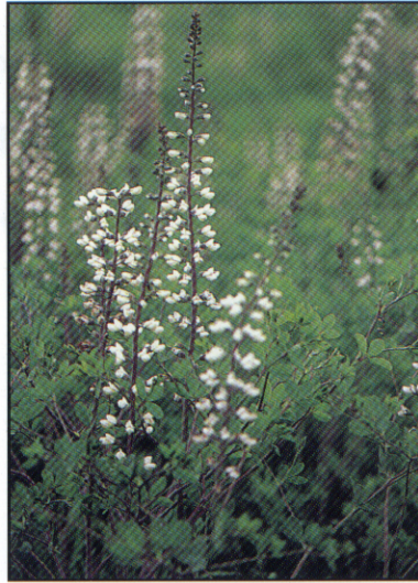
White Wild Indigo ( Baptisia lactea )

2-3' tall, blooms May to June, medium to moist sites, 1585 seeds/oz.