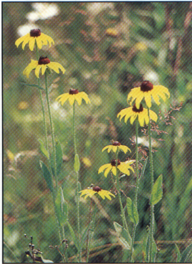
Black-eyed Susan ( Rudbeckia hirta )

2-5' tall, blooms July to Sept., prefers dry sites, 100,000 seeds/oz.