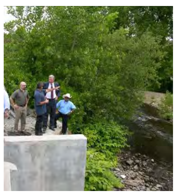
NRCS Staff showcases the fish ladder at Riverside Park during the "America's Great Outdoors Comes to Providence" legislative tour.

Environmental Quality Incentive Program (EQIP), Wildlife Habitat Incentive Program (WHIP), Agricultural Management Assistance (AMA) Program, and the Conservation Stewardship Program (CSP) and the Easement Programs,