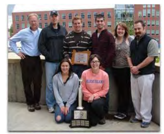
URI Soil Judging Team won first place at the national competition in Bend, OR.

http://cels.uri.edu/news/nSoilchamps.aspx.