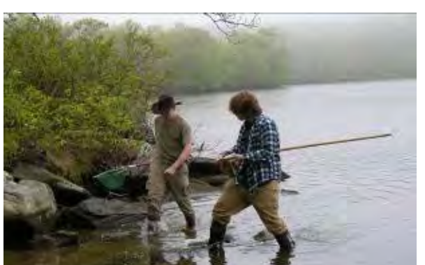
Students participating at the aquatic station during the 2011 Envirothon competition.

In honor of Earth Day, NRCS RI also developed a Conservation Showcase section on its Web site which highlights several conservation success stories throughout the State where NRCS conservation programs have been utilized to improve conservation efforts. Web visitors can also peruse success stories in other States through an interactive map which neatly consolidates success stories throughout the Nation. Information on the Rhode Island success stories may be accessed at the following NRCS RI Web site: