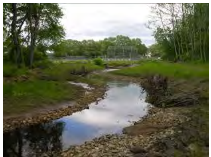
A recently completed waterway in Cranston, RI funded under ARRA EWP.

Construction was completed at all four ARRA EWP-FPE sites.