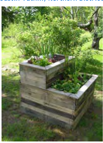
A portable planter in support of "The People's Garden" initiative at the Northern Conservation District Office.

NRCS in conjunction with the Northern Rhode Island Conservation District held the final information/outreach meeting for NRCS programs on June 2, 2011. There were 22 landowners in attendance and approximately 4 applications for NRCS Farm Bill programs were received as a result of the meeting. Currently NRCS has 34 applications – 26 for the Environmental Quality Incentives Program (EQIP) and 8 for the Wildlife Habitat Incentives Program (WHIP). The breakdown of these applications is as follows: