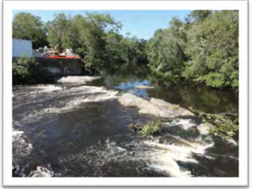
Pawtuxet Falls after dam removal