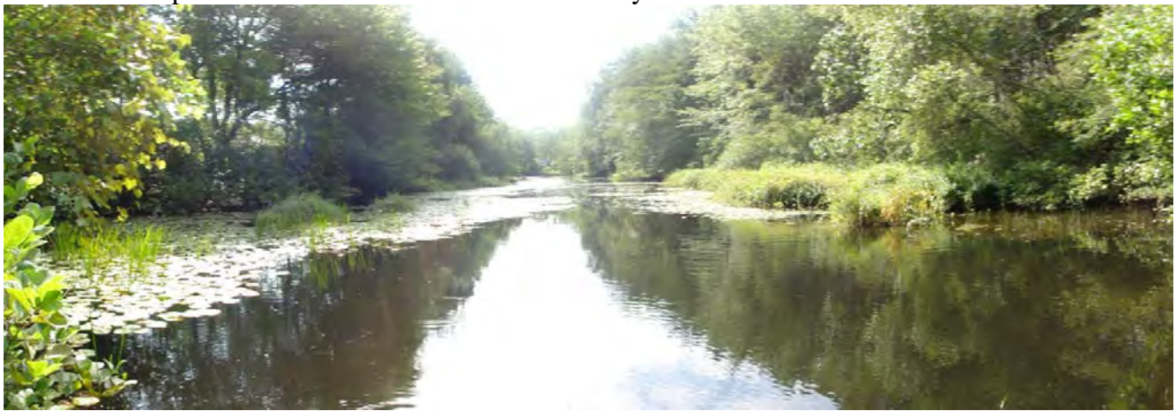
The photo above depicts the Mattatuxet River before dam removal and the photo below depicts a

We have been actively working on a newly contracted fish passage - dam removal project. The dam at the Shady Lea Mill is located on the Mattatuxet River and is 1.5 miles above the fish ladder at the Gilbert Stuart Birthplace on Cards Pond. This river system is a significant anadramous fish run with approximately 50,000 to 100,000 fish reported yearly. This dam removal will open up a half mile of riverine spawning habitat for the alewives and blueback herring and will leave only one impoundment before gaining access into Silver Spring Lake. We have completed a bathymetric survey and ground penetrating radar survey (that shows the original stream bed route). Renderings have been completed that will show what the riverine system will look like after the dam is removed.