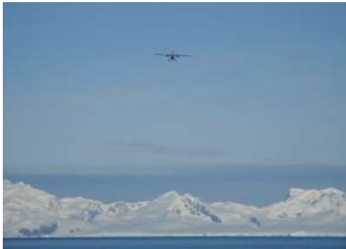
British Antarctic Survey Twin Otter over Gerlache Strait, Antarctica

As part of an official IPY project, the CCGG aircraft group has modified 25 of their programmable flask packages (PFPs) for use on the HIPPO mission, a pole-to-pole air monitoring mission being conducted aboard a specially outfitted Gulfstream V owned by the National Science Foundation and the National Center for Atmospheric Research. For more about HIPPO, see www.eol.ucar.edu/deployment/field-deployments/field-projects/hippo_global