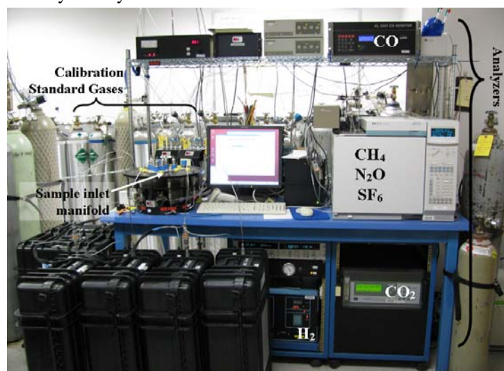
Figure 2: The CCGG analysis system in Boulder, Colorado, consists of a sample inlet manifold; a module for drying samples (behind the PFPs); electronic hardware and software; modified commercial analyzers; & gases for calibration of the analyzers.

can repeatedly measure SF 6 , an extremely powerful greenhouse gas, which, in the atmosphere, is only 1 in every 200 billion molecules, to 1%. For other more abundant gases, we repeatedly measure them to 0.05% or better. In 2008, we made nearly 17,000 high quality measurements for each of six different compounds from the samples collected at surface, aircraft and tower sites. Despite the effort we've put into the measurements, our project could not exist without our partners in the field who conscientiously go out regularly and collect the samples. Again, thank you for your efforts!