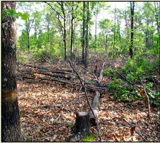
The Nature Conservancy

Thinning woodlands is an important practice to promote a healthy oak-hickory forest suitable for bat habitat.