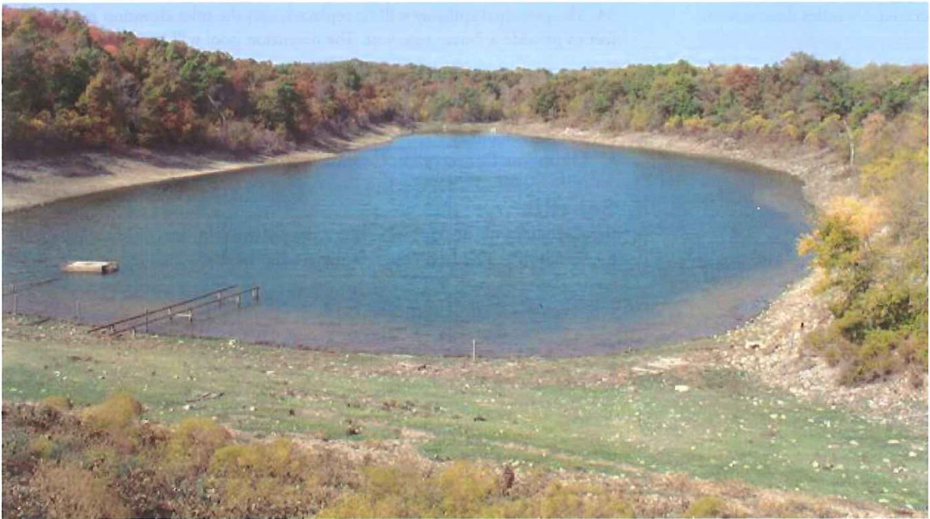
Upper Clear Boggy Watershed Dam No. 35 is part of a 113,482-acre watershed.

USDA, NRCS 100 USDA, Suite 206 Stillwater, OK 74074 (405) 742-1204 www.ok.nrcs.usda.gov