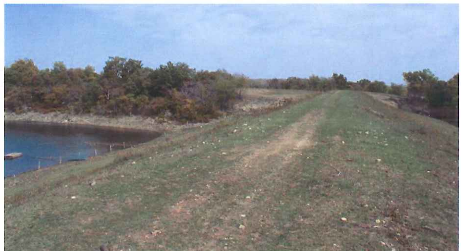
Upper Clear Boggy Watershed Dam No. 35 traps sediment that would otherwise end up in Dam No. 34, located downstream.

Funded through the American Recovery and Reinvestment Act (ARRA) of 2009, this project is part of the Obama Administration's plans to modernize the nation's infrastructure, jump-start the economy, and create jobs. NRCS is using Recovery Act dollars to update aging flood control structures, protect and maintain water supplies, improve water quality, reduce soil erosion, enhance fish and wildlife habitat, and restore wetlands. NRCS acquires easements and restores floodplains to safeguard lives and property in areas along streams and rivers that have experienced flooding.