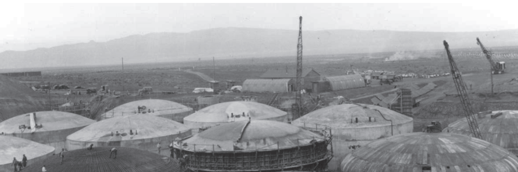
Hanford Tanks circa 1944 Under Construction

Part E of the Act was created as an amendment to EEOICPA in October 2004, transferring the old part D from DOE to DOL. Part E provides coverage to DOE contractor or subcontractor employees, or a RECA section 5 uranium worker who developed an illness, including cancer, beryllium disease, and silicosis, as a result of occupational exposure to a toxic substance at a covered DOE facility.