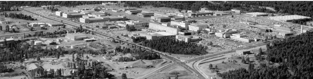
Department of Energy, Los Alamos National Laboratory Circa 1963