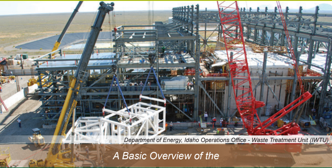
Department of Energy, Idaho Operations Office - Waste Treatment Unit (IWTU)