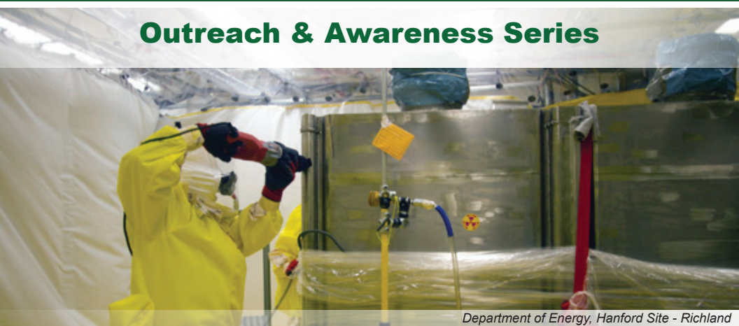
Department of Energy, Hanford Site - Richland