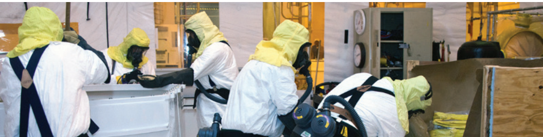
Department of Energy, Los Alamos National Laboratory