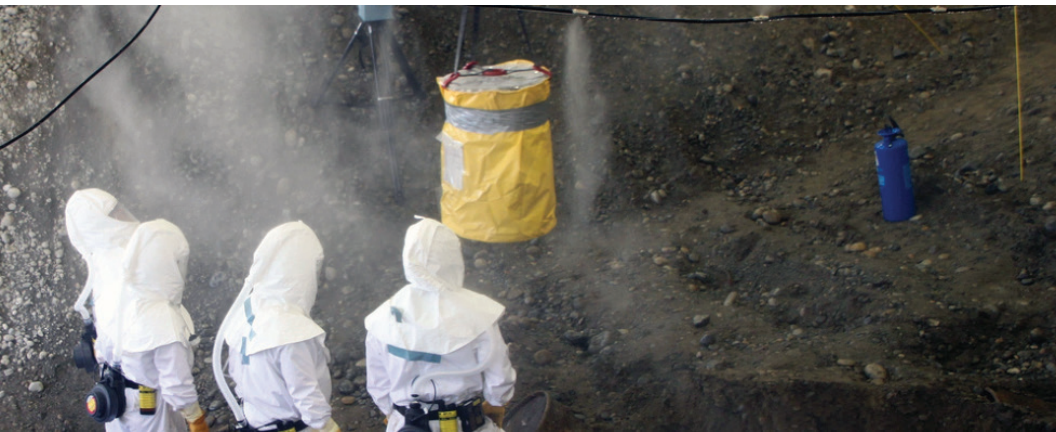
Department of Energy, Hanford Site - Richland

Additionally, DOE has launched an aggressive outreach and awareness campaign to ensure that current DOE contractors and subcontractors recognize the importance of the records they generate and are committed to providing access to these records.