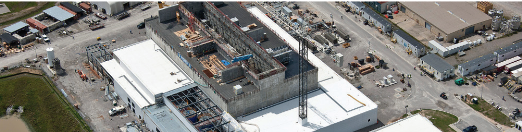
Department of Energy, Savannah River Site - Salt Waste Processing Facility (SWPF)

https://ehss.energy.gov/Search/Facility/findfacility.aspx