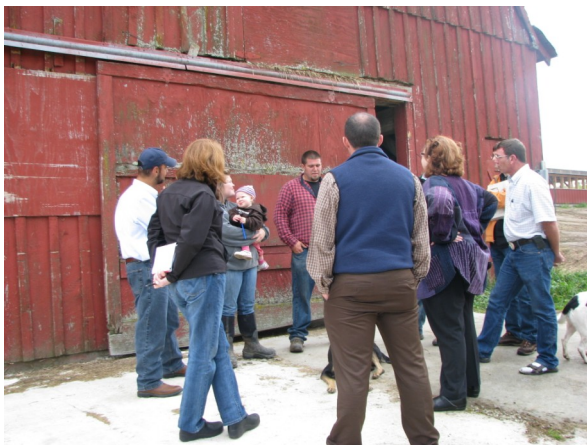
Hemond Hog Farm