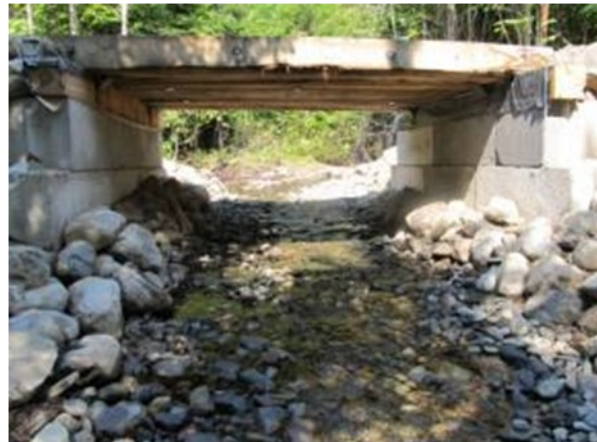
The above photos show the before and after construction of the first culvert that was removed on a tributary to Mountain Brook in 2012. The pre-existing culvert was a 4-foot round boiler pipe, it was replaced with bridge abutments with a 14-foot span.

Man-made obstructions have confined alewives to a small percentage of their ancestral spawning area in the Penobscot River Basin. Mattamiscontis Lake, which means a fishing place for alewives by the Penobscot Nation people, has a limited spawning alewife population due to a remnant log drive dam that has been in place prior to the 1880's. This 1,000-acre lake has the potential to support an alewife spawning population of approximately 240,000. This structure during low flows reduces the number of alewives able to gain access to the lake to spawn and traps juvenile alewives during their downstream migration. The remnant dam structure was removed and a series of rock weir step pools were installed to serve as resting places during migrations and to maintain the current lake level. This project is not only important for Penobscot Nation traditional culture but the overall ecological health of the Penobscot River, and was labeled by the Maine Department of Marine Resources as a priority alewife restoration lake. Partners included the Penobscot Nation, USFWS, Maine Department of Marine Resources, and Atlantic Salmon Federation.