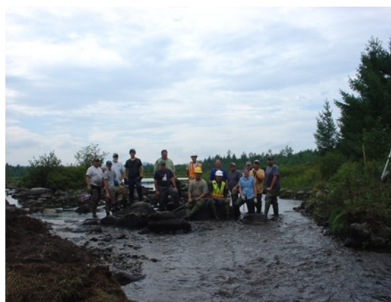
The above photos show the before and after deconstruction of a remnant log drive dam on Roaring Brook.