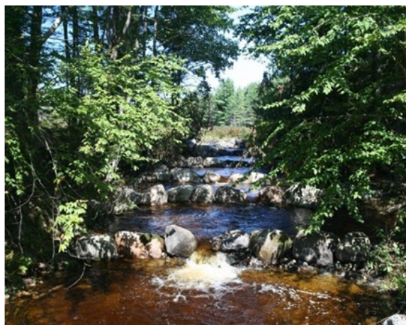
The above photos show the before and after construction of the fishway at Mattamiscontis.

A remnant log drive dam on Roaring Brook in the Pleasant River drainage was confirmed in late June of this year by Ben Naumann, NRCS Fisheries Biologist, and was removed in August which was an amazing start to finish turnaround time for a stream connectivity project. The dam held back over a half mile of deadwater habitat creating a thermal barrier for cold water fish species like brook trout and Atlantic salmon. The removal of the dam has reduced the half-mile impoundment above the dam site and has re-connected an additional 7 miles of stream habitat. NRCS provided the coordination, land owner contacts and technical assistance for this project. Partners included Elliotsville Plantation Inc., USFWS, Maine Department of Marine Resources, Maine Department of Inland Fisheries and Wildlife, and Trout Unlimited. The dam was removed by 15 individuals using hand equipment and hoist system type technologies.