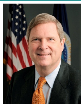
Secretary Tom Vilsack will remain on board for President Obama's second term.

Americans. However, while I am relieved that the agreement reached prevents a spike in the price of dairy and other commodities, I am disappointed congress has been unable to pass a multi-year reauthorization of the Food, Farm and Jobs bill to give rural America the long-term certainty they need and deserve. I will continue to work with Congress to encourage passage of a reauthorized bill that includes a strong and defensible safety net for producers, expanded rural economic opportunity in the new bio-based economy, significant support for conserving our natural re-