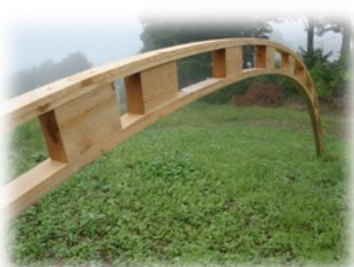
A piece of the Gothic arch frame.