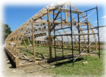
The CIG high tunnel in progress. An NRCS high tunnel is seen in the background.