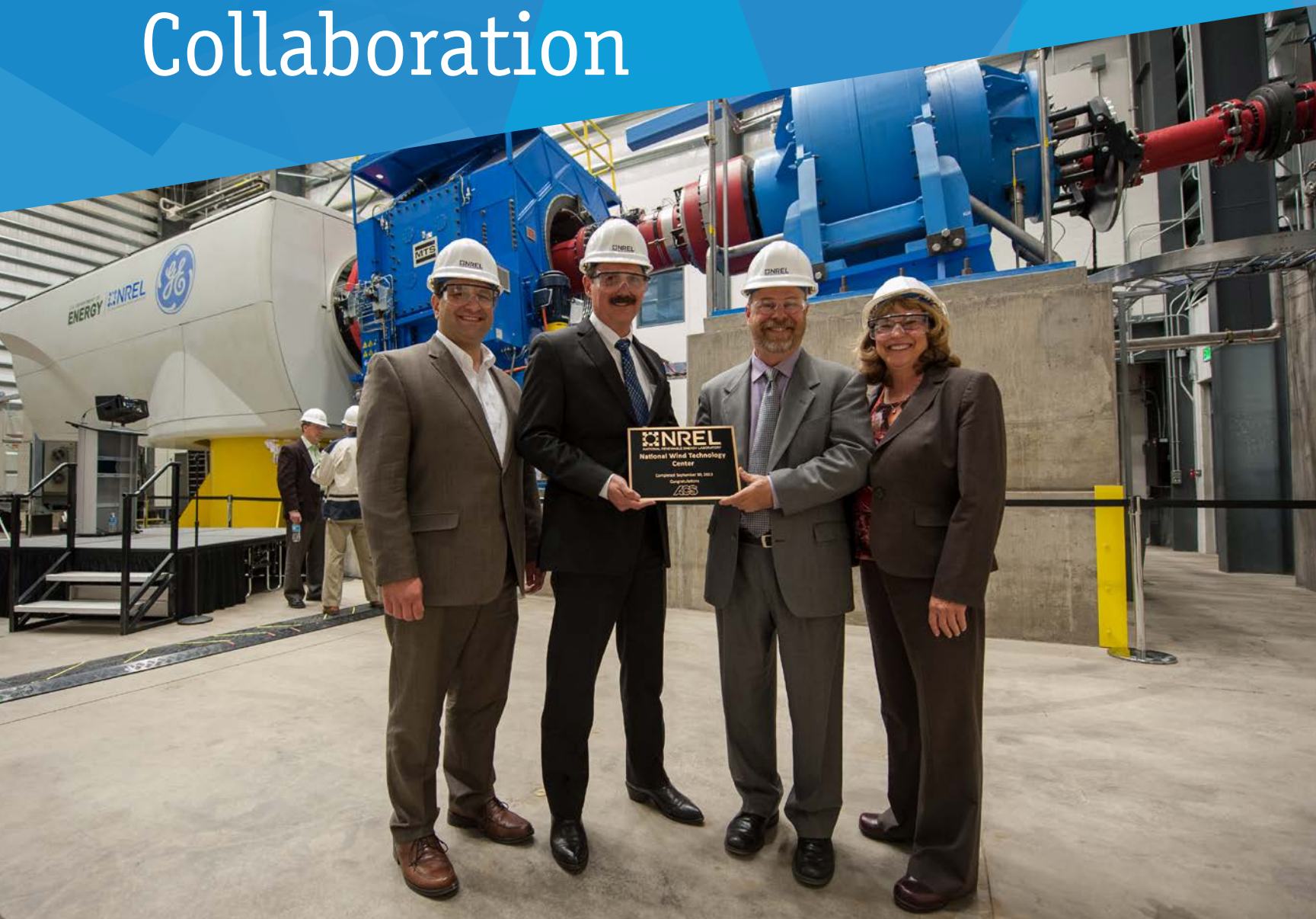
GE Power and Water, DOE, and NREL officials join together to celebrate the commissioning of the new 5-megawatt dynamometer test facility at the NWTC. Here, partners can test their wind and water power turbine drivetrains in a controlled environment. Photo by Dennis Schroeder, NREL 28235