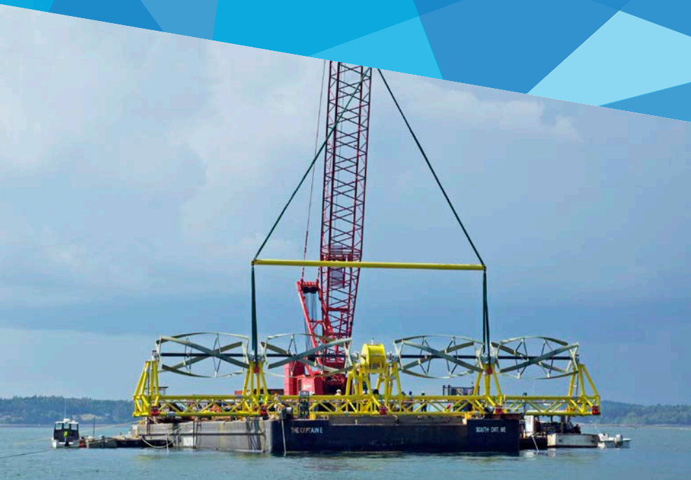
NREL has the capabilities to research and test new wind and water power technologies. One such device is Ocean Renewable Power Company's TidGen Power System, shown here.