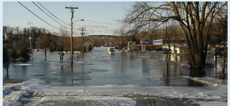
The Sandy River flooded Farmington in January 2006.

Rising temperatures and shifting rainfall patterns are likely to increase the intensity of both floods and droughts. Average annual precipitation in the Northeast increased 10 percent from 1895 to 2011, and precipitation from extremely heavy storms has increased 70 percent since 1958. During the next century, average annual precipitation and the frequency of heavy downpours are likely to keep rising. Average precipitation is likely to increase during winter and spring, but not change significantly during summer and fall. Rising temperatures will melt snow earlier in spring and increase evaporation, and thereby dry the soil during summer and fall. So flooding is likely to be worse during winter and spring, and droughts worse during summer and fall.