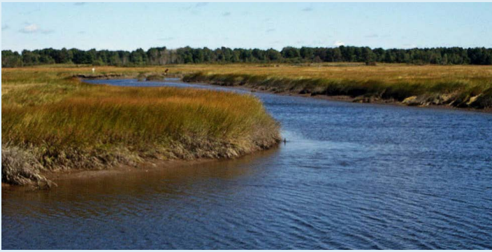
Sea level rise threatens salt marshes like Scarborough Marsh, which is Maine's largest.