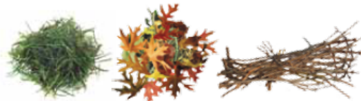
Yard Trim (grass, leaves, light brush, weeds)