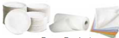
Paper Products (plates, napkins, paper towels)