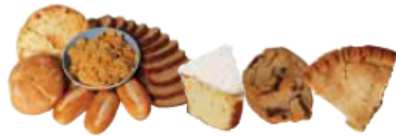
Bread, grains, baked goods, etc.