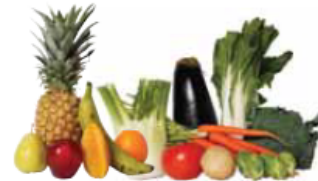
Fruits & Vegetables (fresh or cooked)