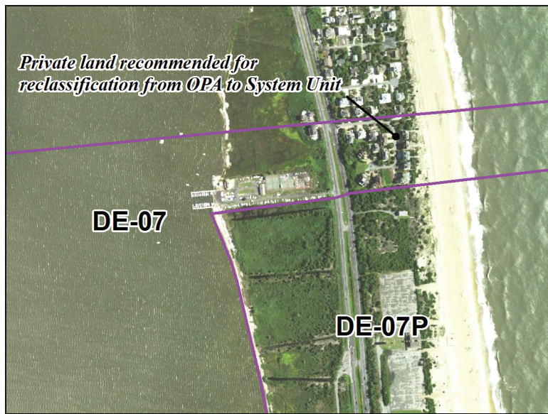
Figure 27. Private land adjacent to Delaware Seashore State Park is recommended to be reclassified from OPA Unit DE-07P to System Unit DE-07. The Service determined that this area was undeveloped when it was added to the CBRS and the boundary was intended to follow the 1990 break-in-development.

and in other cases include none of the channel within the unit. The 2008 pilot project report proposed standardizing the channel mapping protocol to include the entire channel within System Units, but to include only half of the channel within OPAs (as there is no impact to channels in OPAs, the only restriction within OPAs is on Federal flood insurance).