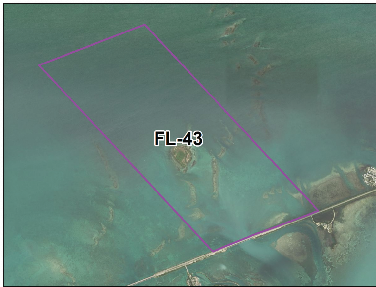
Figure 28. In limited cases, no boundary modification is necessary. The final recommended boundary for Florida Unit FL-43, shown in purple, is identical to the existing boundary.