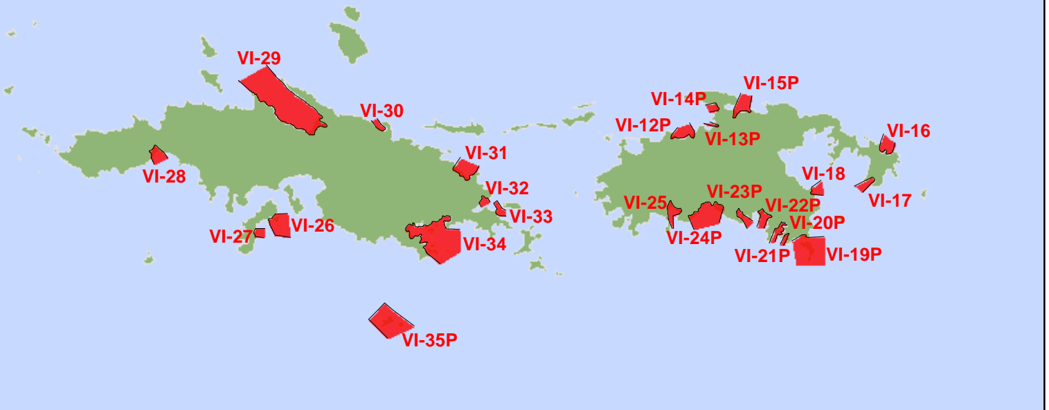
St. Thomas and St. John Islands