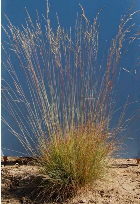
Willamette Valley Germplasm Roemer's fescue.

A Conservation Plant Release by USDA NRCS Corvallis Plant Materials Center, Corvallis, Oregon