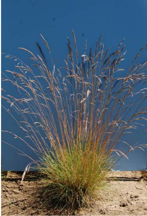
Northwest Maritime Germplasm Roemer's fescue.

A Conservation Plant Release by USDA NRCS Corvallis Plant Materials Center, Corvallis, Oregon