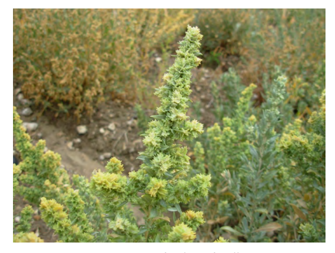
Wytana moundscale seed stalk

fill. Average harvest date at the Bridger Plant Materials Center is October 1. Seed yields average 150 and 300 pounds per acre under dryland and irrigated conditions.