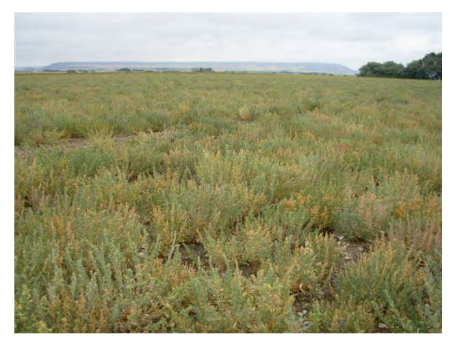
Wytana seed field at Brian Duyck's farm near Powell, Wyoming

winged seed. For best results, seed should be planted into a firm, weed-free seedbed. It is recommended that Wytana be included as a component of a native seed mixture at a rate not to exceed <sup>1</sup>/<sub>4</sub> to <sup>1</sup>/<sub>2</sub> pound pure-liveseed per acre. When used in a mix, adjust the seeding rate to the desired percentage of mix. A seeding depth of <sup>1</sup>/<sub>2</sub>- to <sup>3</sup>/<sub>4</sub>-inch is recommended. Seed should be dormant planted after October 15. Seedlings are vigorous and survive well, but resistance to insects and disease (damping off) is poor, and tolerance to shading is only fair. It reproduces by seed and vegetatively by root sprouting.