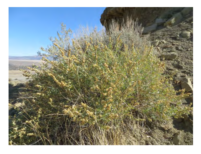
Moundscale growing in the wild near Warren, Montana

A Conservation Plant Release by USDA NRCS Bridger Plant Materials Center, Bridger, MT