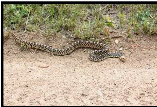
Photographs of the non-venomous Bullsnares. This is an adult from Northwestern Kansas.