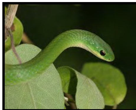
Photographs of the non-venomous smooth green snake.