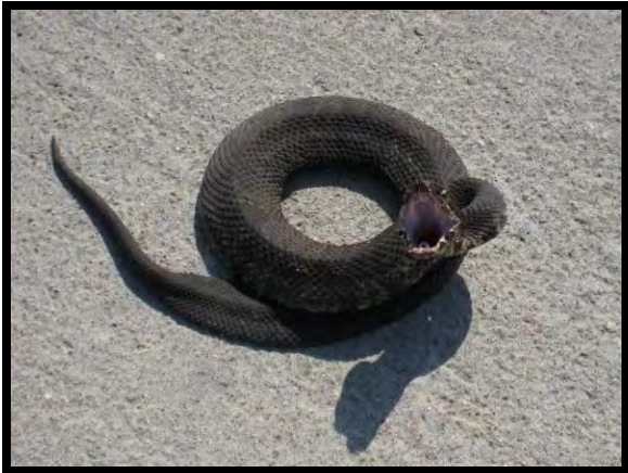
Photograph of a venomous Cottonmouth Snake.

If a Gulf salt marsh snake is encountered during construction, the snake should be allowed sufficient time to move away from the site or be relocated by a qualified wildlife biologist before construction or clearing is resumed. Only a qualified wildlife biologist is permitted to come in contact with the snake. Construction can resume after the snake has moved from the area or has been relocated.