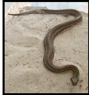
Photographs of the non-venomous Gulf salt marsh snake.