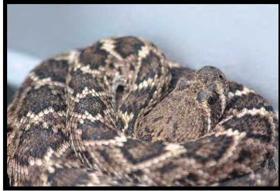
Photographs of the venomous western diamond-backed rattlesnake. This individual is a juvenile from North Texas.