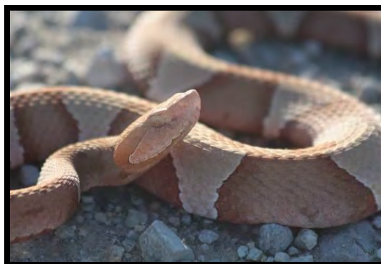
Photographs of the venomous Copperhead. This individual is a juvenile from North Texas.