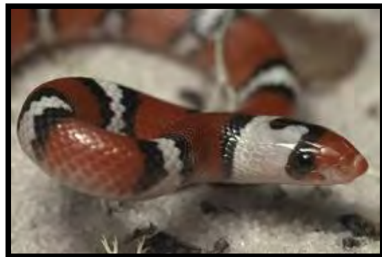
Photographs of the non-venomous Texas scarlet snake, which is often mistaken for a venomous coral snake (see below photographs) and killed.