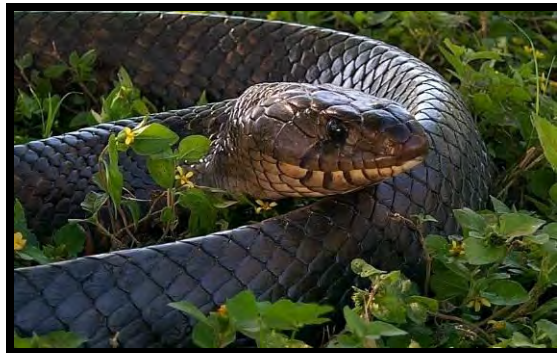
Photographs of the non-venomous Texas Indigo Snake.