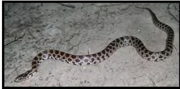
Photographs of the non-venomous yellow-bellied kingsnake.