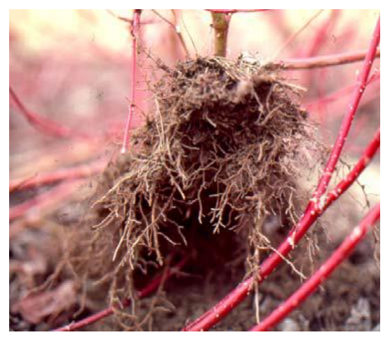
Photo taken at the USDA NRCS, Big Flats Plant Materials Center, showing the roots of 'Ruby'.

In landscape plantings, it is helpful to prune 'Ruby' to within 6 inches of the soil surface in March, every other year. This will cause re-growth of long young stems. Well established plants will grow 4-6 foot stems the summer after pruning.