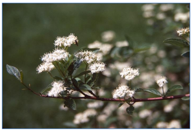
'Ruby' red osier dogwood in full bloom. Photo taken at the USDA NRCS Big Flats Plant Materials Center.

A Conservation Plant Release by USDA NRCS Big Flats Plant Materials Center, Corning, New York