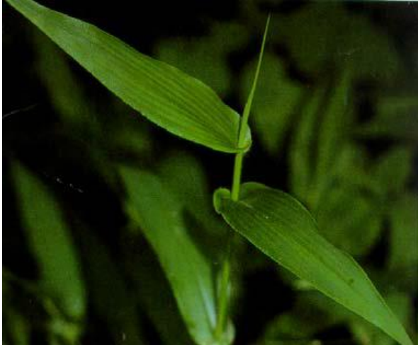
Close up of 'Tioga' deertongue stem and leaf blades. Photo taken at the USDA NRCS Big Flats Plant Materials Center.

A Conservation Plant Release by USDA NRCS Big Flats Plant Materials Center, Corning, New York