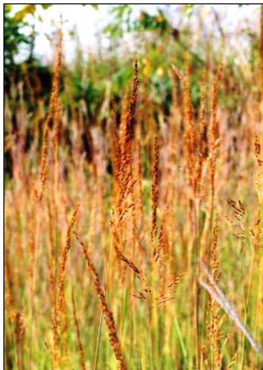
Suther Germplasm Indiangrass (Sorghastrum nutans (L.) Nash) is source-identified germplasm released by the Cape May Plant Materials Center in 2002.

Suther Germplasm Indiangrass is a source-identified germplasm released by the Cape May Plant Materials Center, Cape May NJ, in 2002.