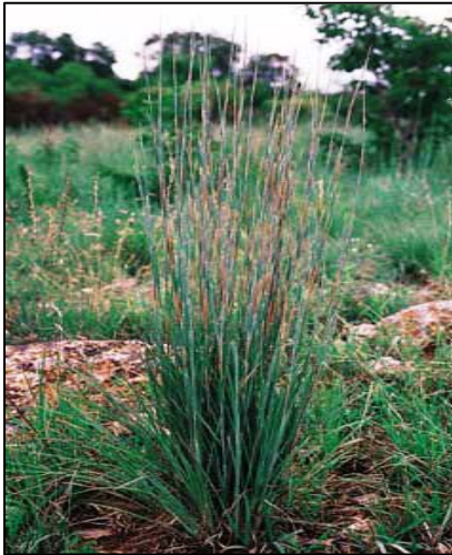
Suther Germplasm little bluestem (Schizachyrium scoparium (Michx.) Nash.) is source-identified germplasm released from the Cape May Plant Materials Center in Cape May, NJ in 2002 .

Suther Germplasm little bluestem is a source-identified germplasm released by the Cape May Plant Materials Center, Cape May NJ, in 2002.