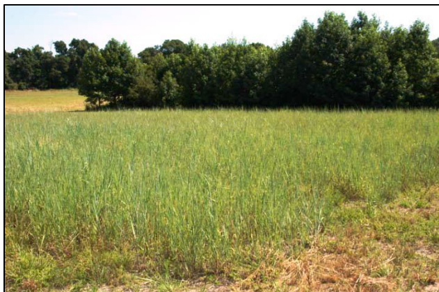
Photograph of Timber Germplasm switchgrass in second year of establishment from seed.

Switchgrass seedlings are slow to establish relative to cool-season grasses such as fescue and ryegrass. Stands that appear poor the first year will most likely improve the second growing season. Two or more years may be required to establish productive stands for seed production. To control weeds mow to the height of 4–6 inches three to four times the first year after planting. Pre and post-emergent herbicides for broadleaf and grassy weeds may be applied, however do not apply post-emergent herbicide until switchgrass has developed at least four leaves.