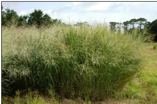
Timber Germplasm switchgrass ( Panicum virgatum ) is a source-identified germplasm released from the Cape May Plant Materials Center (PMC) in Cape May, NJ in 2009.

Timber Germplasm switchgrass is a source-identified germplasm released by the Cape May Plant Materials Center (PMC), Cape May NJ, in 2009.