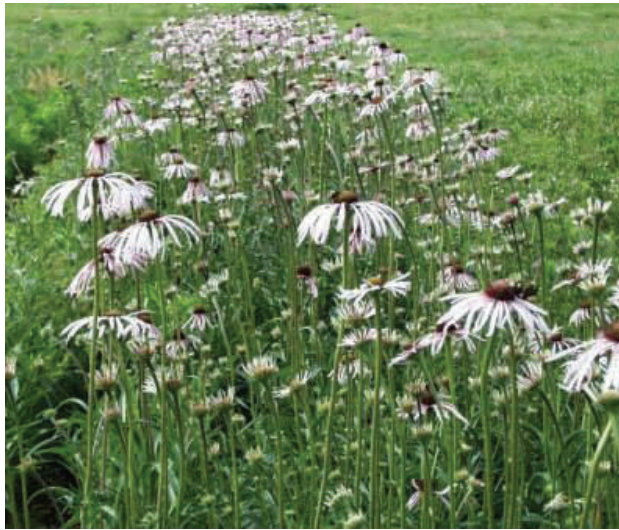
Northern Missouri Germplasm Pale Purple Coneflower Production Plot

Foundation seed of Northern and Western Missouri Germplasm pale purple coneflower are being produced in limited supply by the Elsberry Plant Materials Center (PMC).