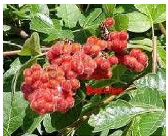
Figure 1. Leaves and fruit cluster of aromatic sumac in the summer around mid July.

A Conservation Plant Release by USDA NRCS Manhattan Plant Materials Center, Manhattan, Kansas