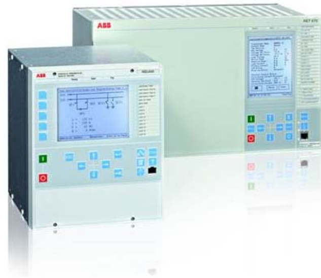
CODEF project depiction of collaborative device-checking, alongside targeted ABB products that will implement the system