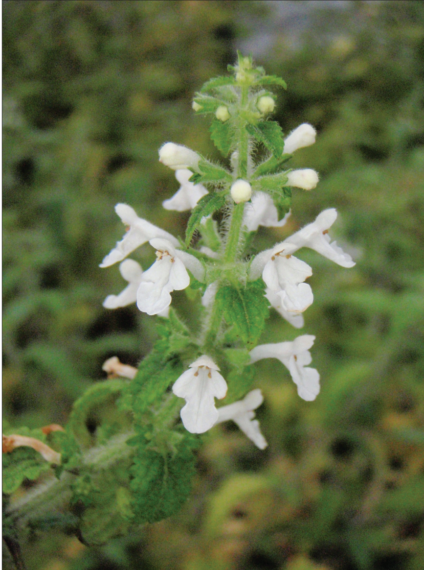
Phyllostegia hispida .