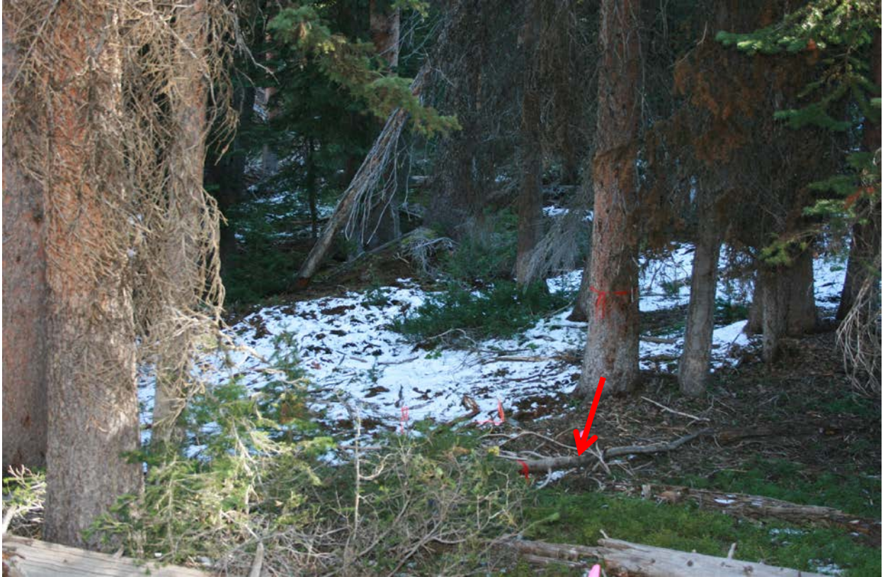
Figure 4. The view along the game trail in the assumed direction of travel by Mr. Stewart. The presumed attack site is in the foreground as noted by the flag where Mr. Stewart's hat and sunglasses were found. Red arrow points to human blood on a log. It is believed Mr. Stewart's body was dragged over this log toward the cache site. Cache site shown in Figure 3 is immediately behind trees on the left. Note limited sight distance in this area.

the vegetation plot he was assigned to survey took him through timbered habitat on a game trail and it was along this trail that Mr. Stewart's remains were found (Figures 3 and 4). The fatality site where Mr. Stewart's remains were found had limited visual sight distance because of relatively thick vegetation and undulating topography. From the direction we assume Mr. Stewart was travelling, the trail approaches the fatality site over a slight rise so that a person approaching the site could not see ahead until they came over this rise.