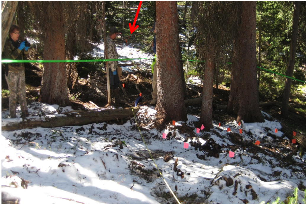
Figure 3. Cache in the foreground where Mr. Stewart's remains were found mixed in with the remains of a mule deer. Flags indicate remains. The assumed direction of travel into the site by Mr. Stewart is noted by the red arrow. Red arrow stops at the apparent site of the attack as noted by the presence of Mr. Stewart's hat and sunglasses and noted by red flags at that location.