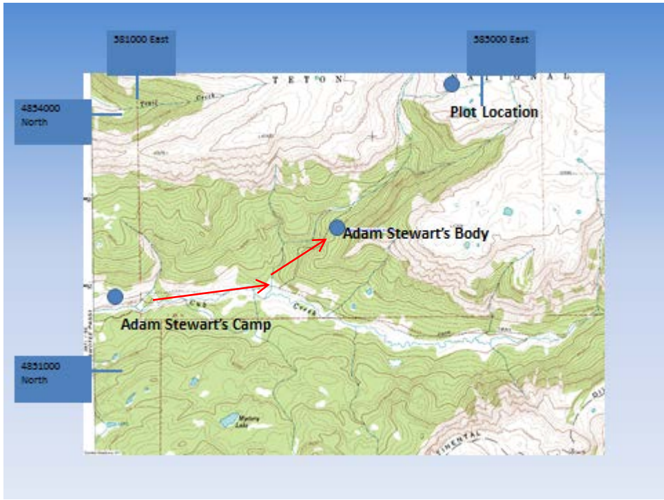
Figure 2. Overview map of Cub Creek, the camp and fatality sites, and the location of the vegetation plot Mr. Stewart was to visit. Red arrows note assumed direction of travel from the camp to the fatality site. See Figure 6 for an aerial view of this area.