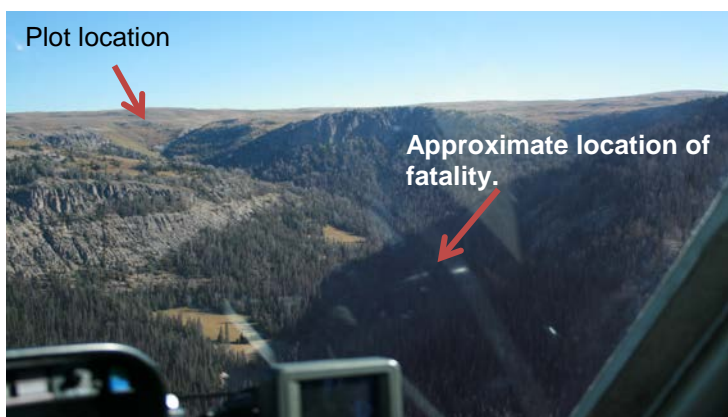
Figure 1. Aerial view of upper Cub Creek, the location of the fatality site, and the general location of the vegetation plot that was Mr. Stewart's objective.

The Cub Creek trail goes through timber and eventually enters high elevation grizzly bear habitat (Figures 1 and 2). The route that Mr. Stewart apparently chose to travel to